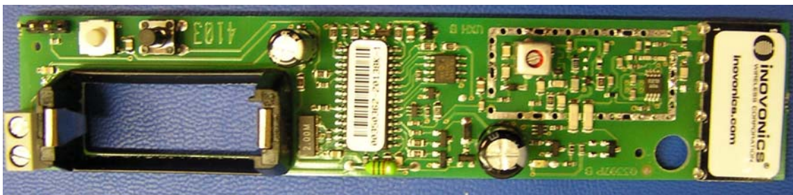
Photograph of the FA-250M board with the shield removed.