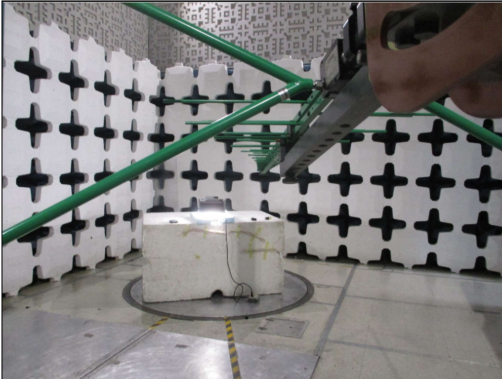
Test Setup for Spurious Radiated Emissions, 30MHz to 1GHz – Antenna Polarization Horizontal