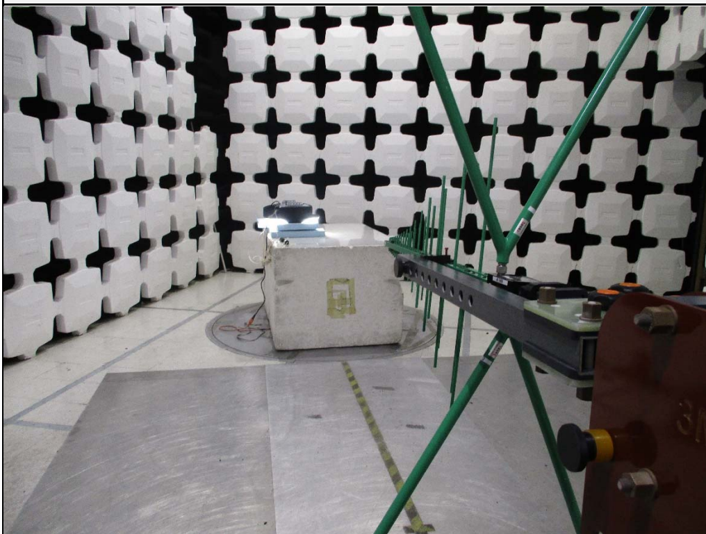
Test Setup for Spurious Radiated Emissions, 30MHz to 1GHz – Antenna Polarization Vertical