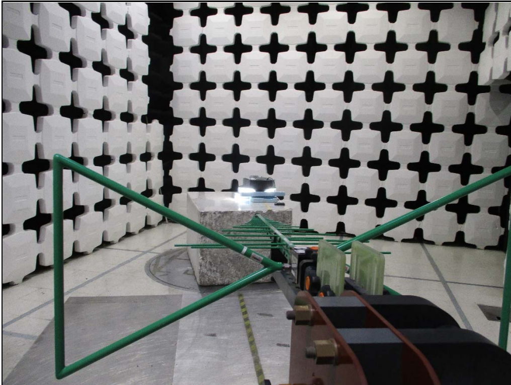
Test Setup for Spurious Radiated Emissions, 30MHz to 1GHz – Antenna Polarization Horizontal