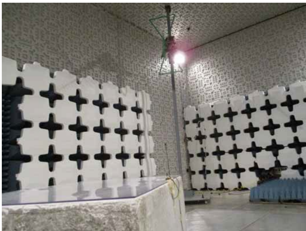
Test Setup for Receiver Spurious Radiated Emissions – 30MHz to 1GHz, Vertical Polarization