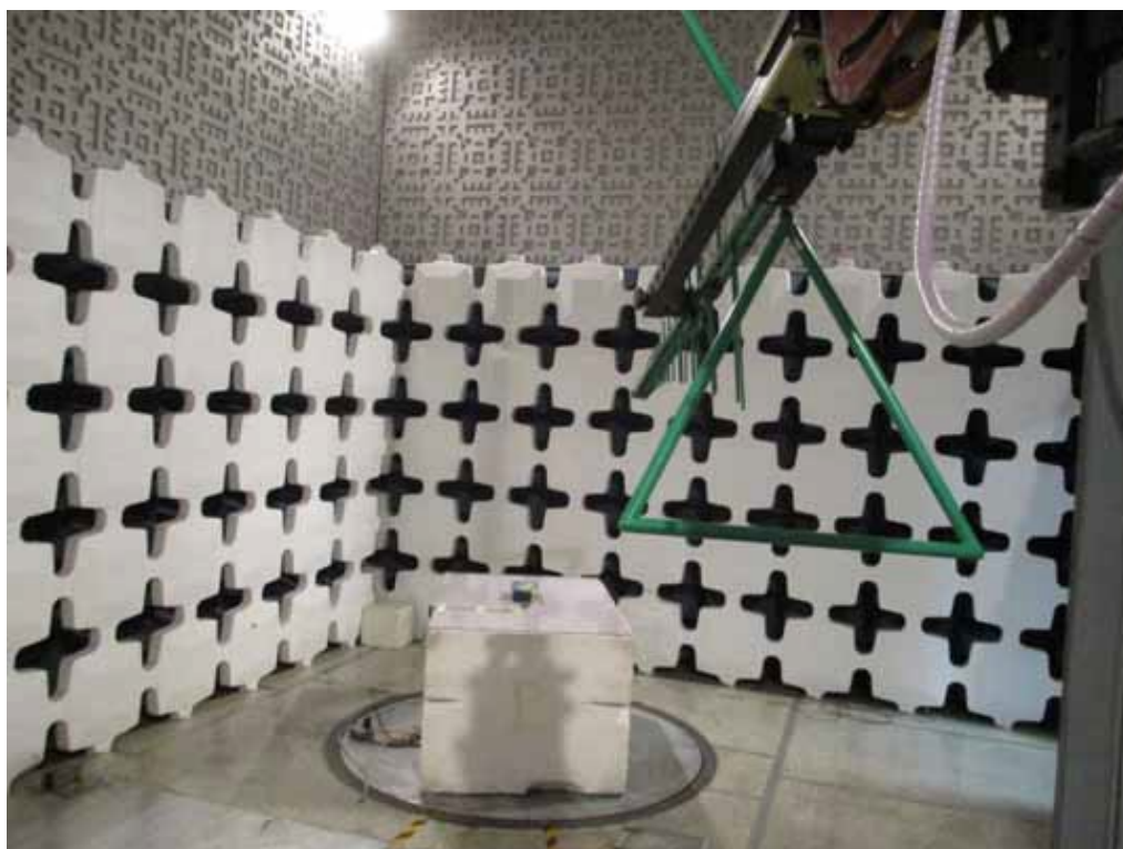
Test Setup for Transmitter Spurious Radiated Emissions – 30MHz to 1GHz, Vertical Polarization