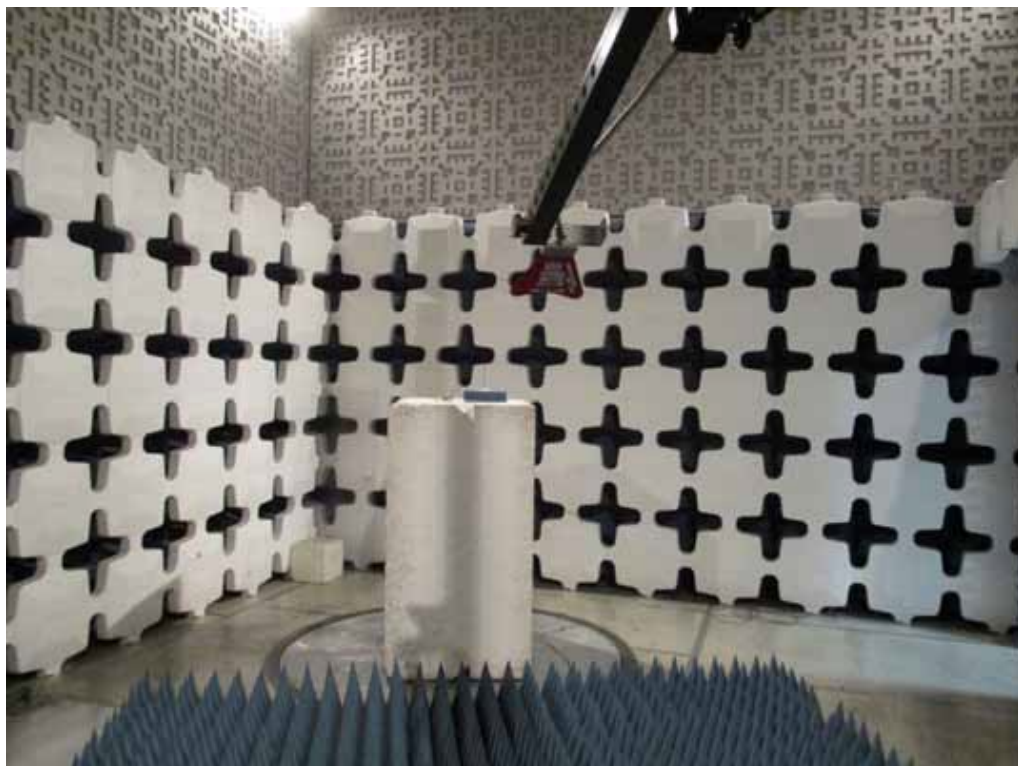
Test Setup for Transmitter Spurious Radiated Emissions – Above 1GHz, Vertical Polarization