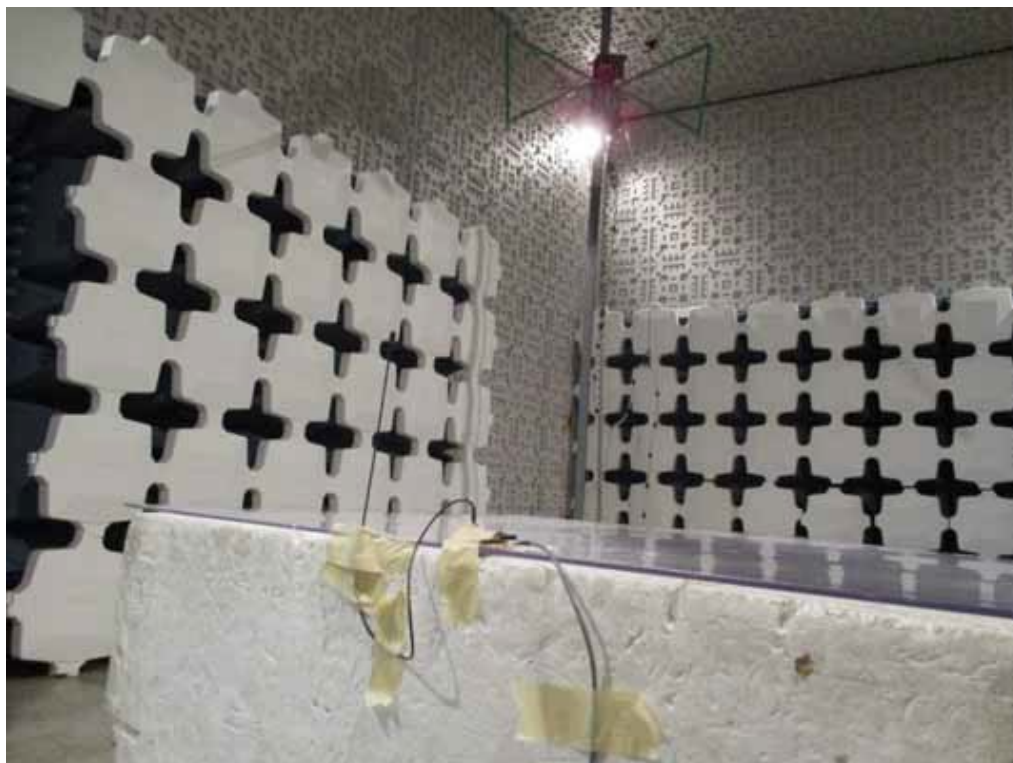
Test Setup for Receiver Spurious Radiated Emissions – 30MHz to 1GHz, Horizontal Polarization