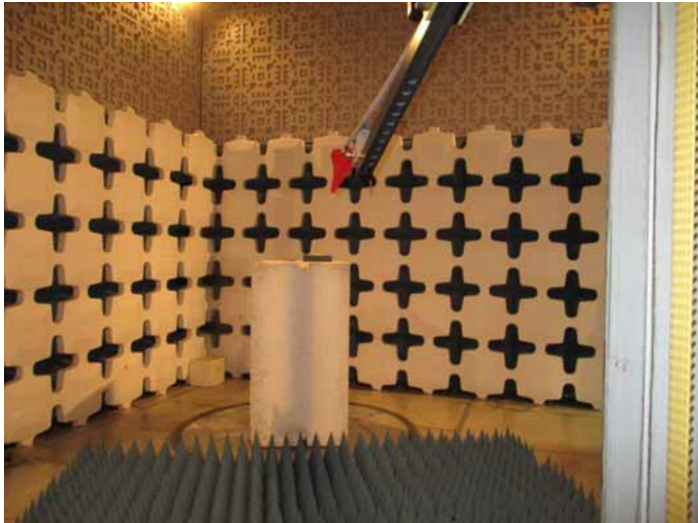
Test Setup for Transmitter Spurious Radiated Emissions – Above 1GHz, Horizontal Polarization