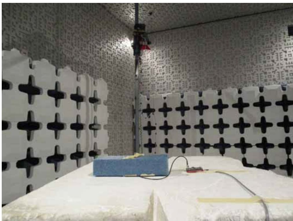
DUT Setup for Transmitter Spurious Radiated Emissions Tests