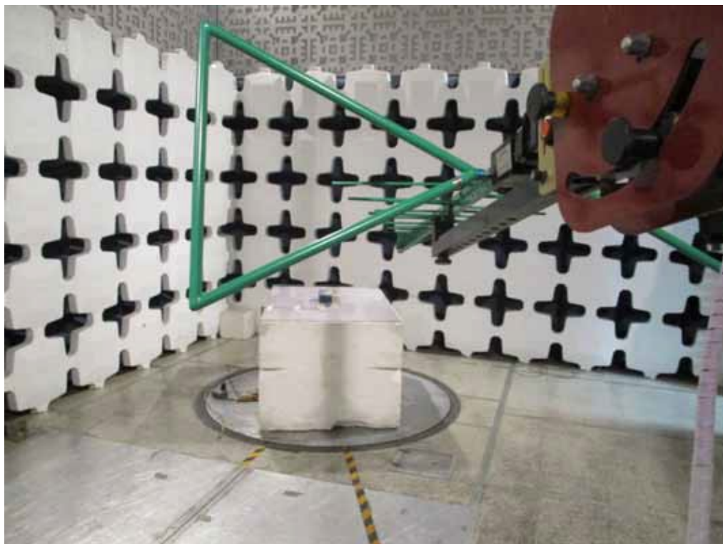
Test Setup for Transmitter Spurious Radiated Emissions – 30MHz to 1GHz, Horizontal Polarization