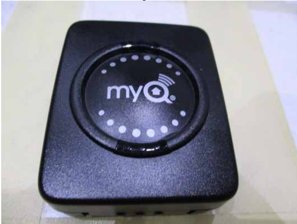
Photograph of EUT