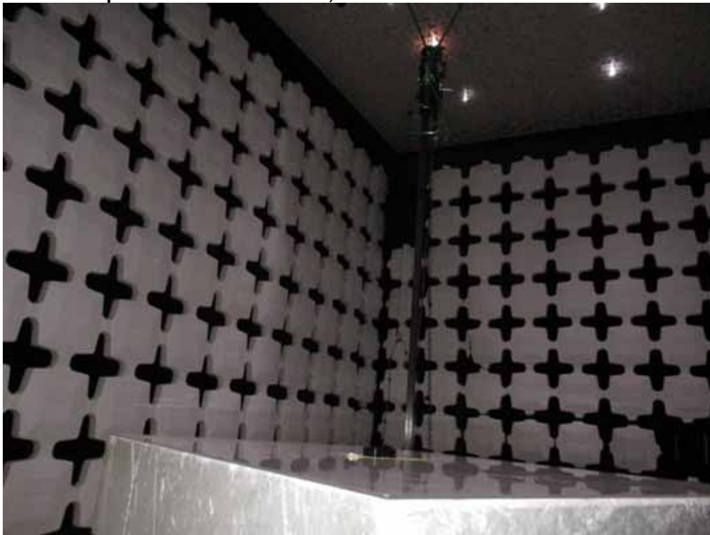
Test Setup for Radiated Emissions, 30MHz to 1GHz – Vertical Polarization