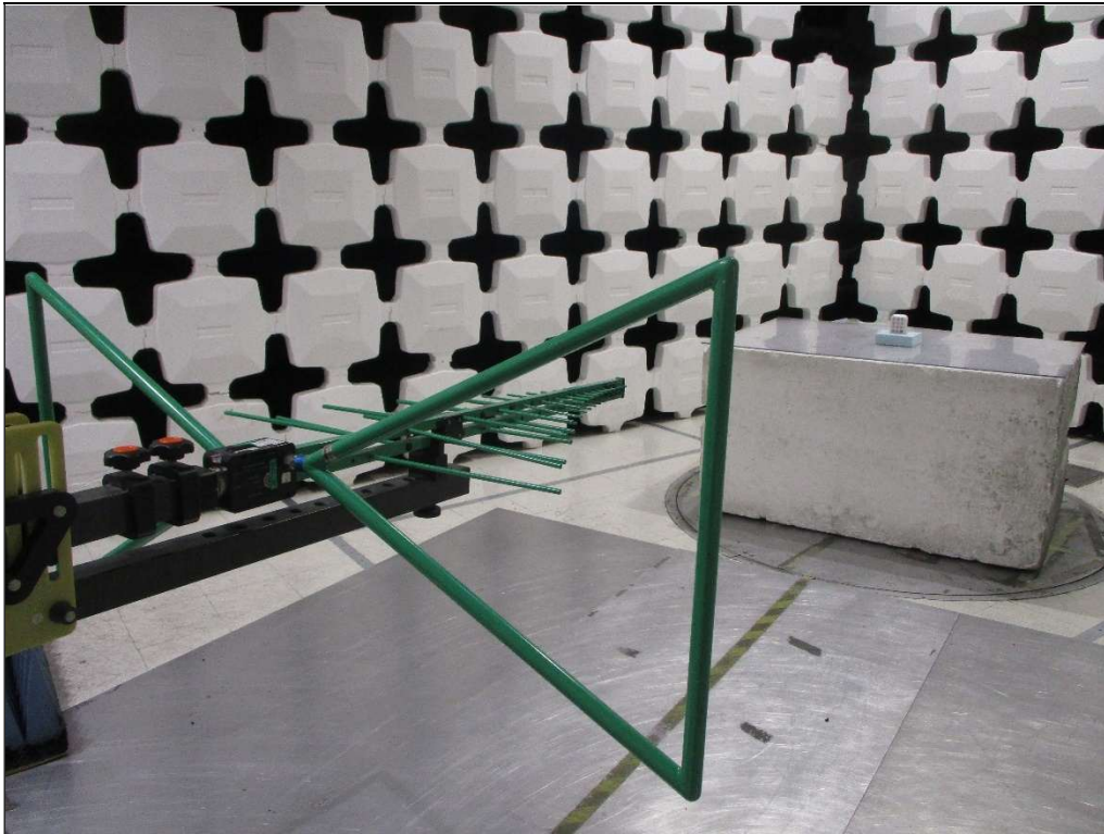
Test Setup for Spurious Radiated Emissions, 30MHz – 1GHz – Antenna Polarization Horizontal