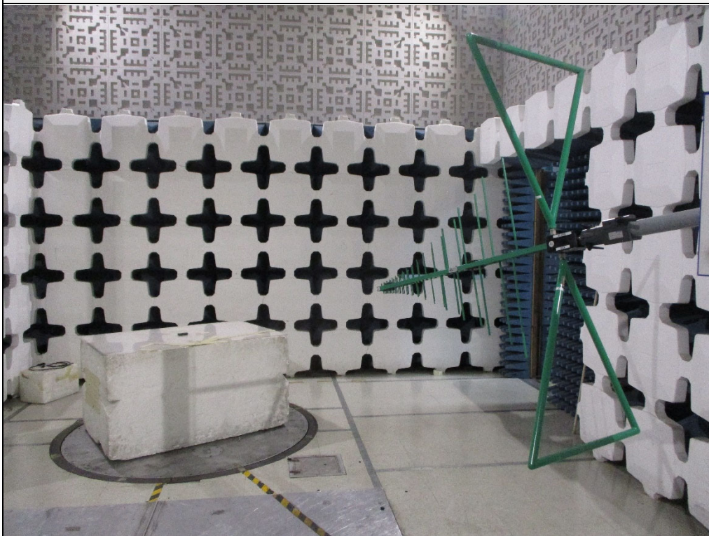
Test Setup for Spurious Radiated Emissions, 30-1000MHz – Antenna Polarization Vertical