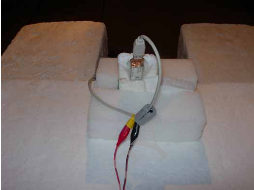
- Front view (Z axis) -

Photograph present configuration with maximum emission