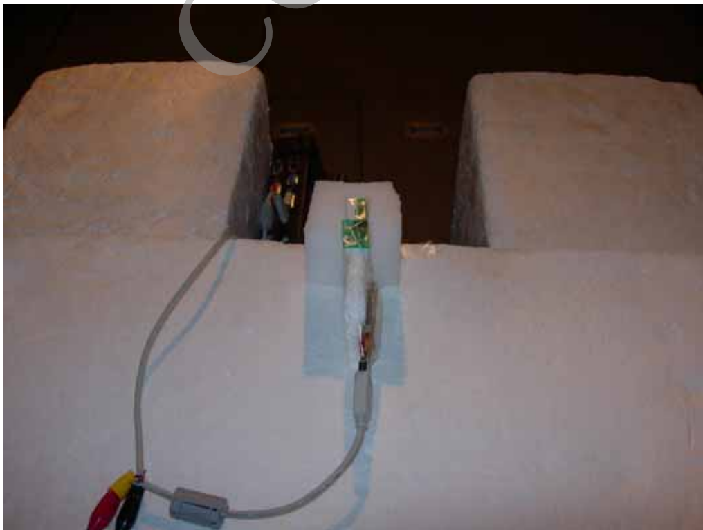
- Rear view (Y axis) -