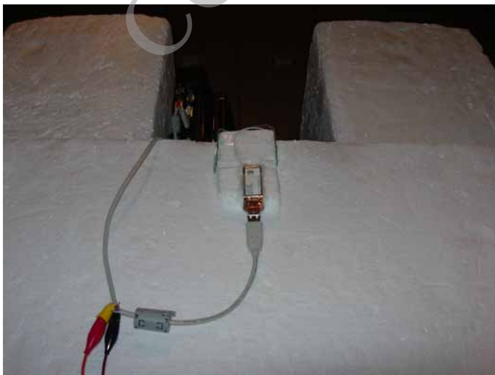
- Rear view (X axis) -