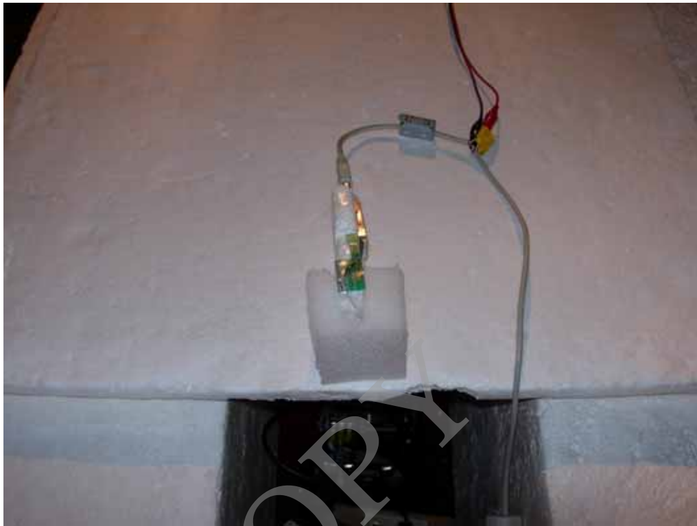
- Front view (Y axis) -

Photograph present configuration with maximum emission