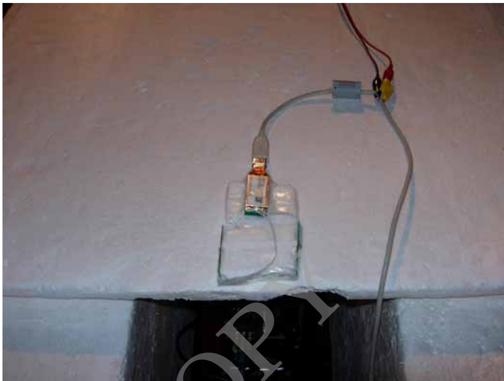
- Front view (X axis) -

Photograph present configuration with maximum emission