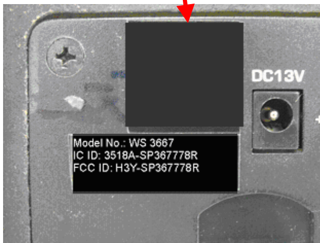
Size: 30 x 10mm