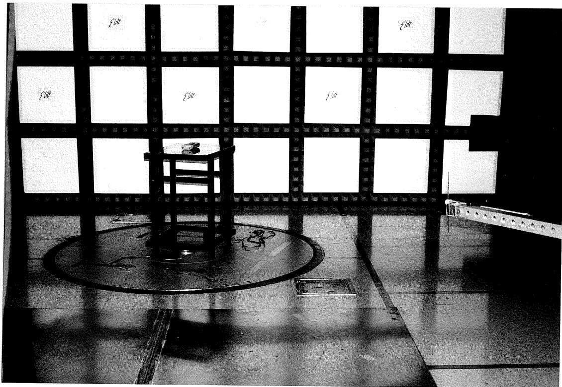
FIGURE 2B TEST SETUP FOR RADIATED EMISSIONS MEASUREMENTS MAXIMIZED FOR MEASUREMENT OF WORST CASE EMISSIONS VERTICAL POLARIZATION