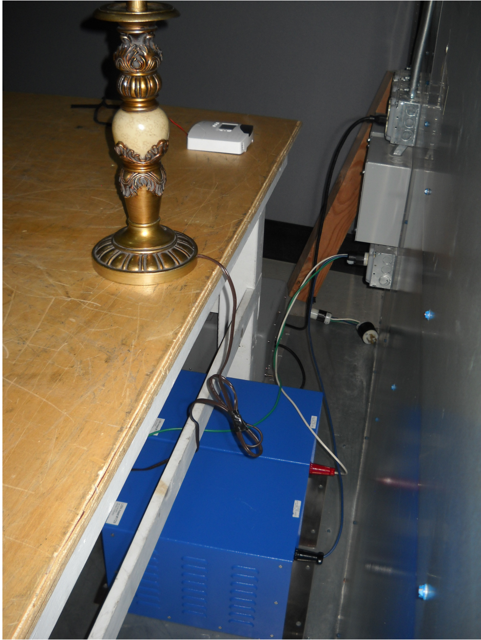
AC Conducted Emissions – Rear View