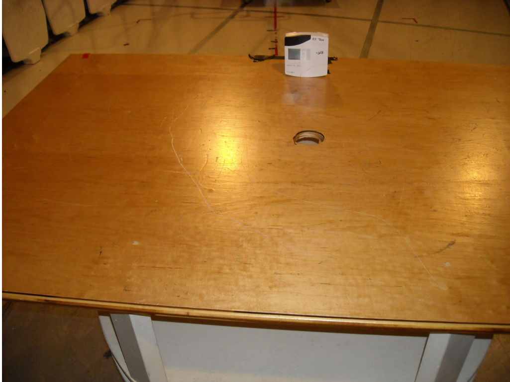
Radiated Emissions - Front View