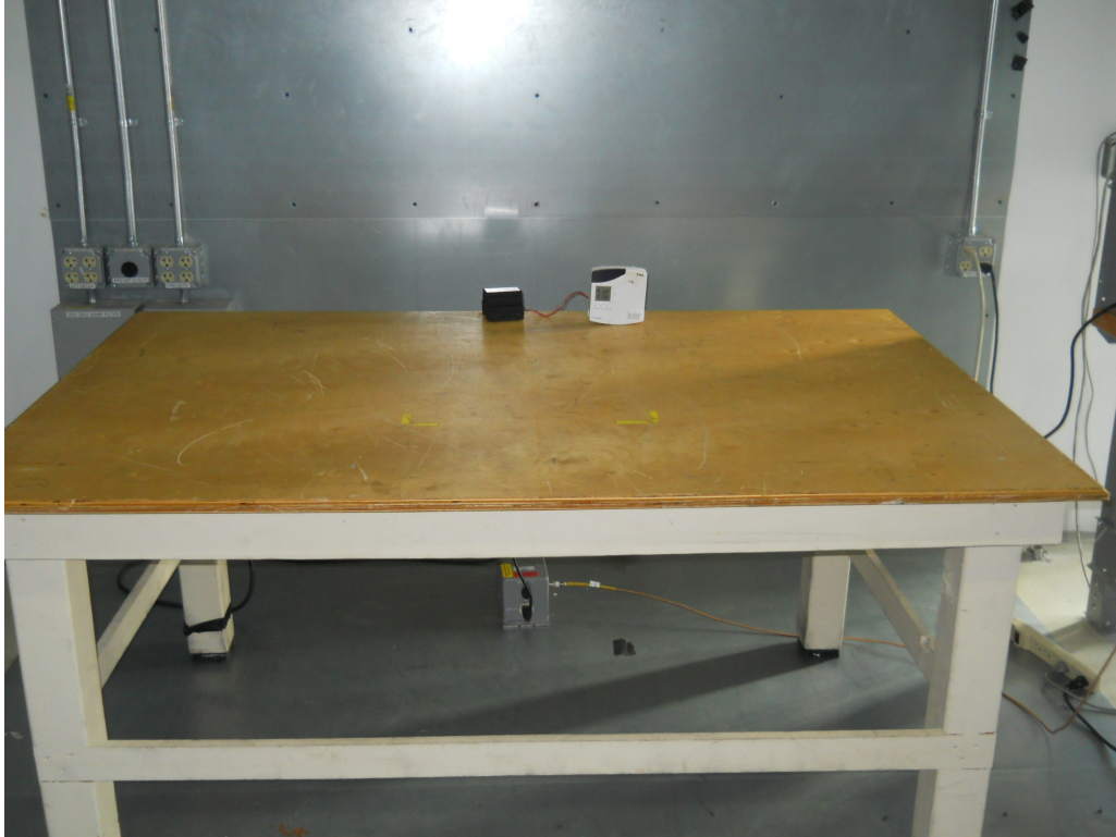
AC Conducted Emissions – Front View