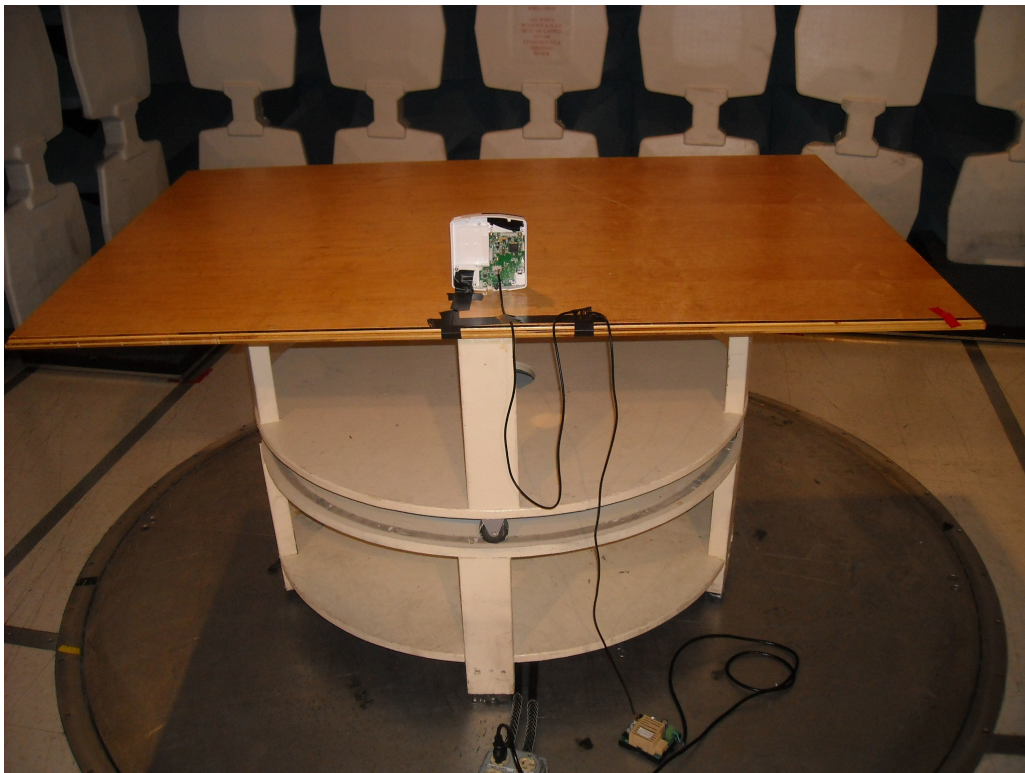
Radiated Emissions – Rear View