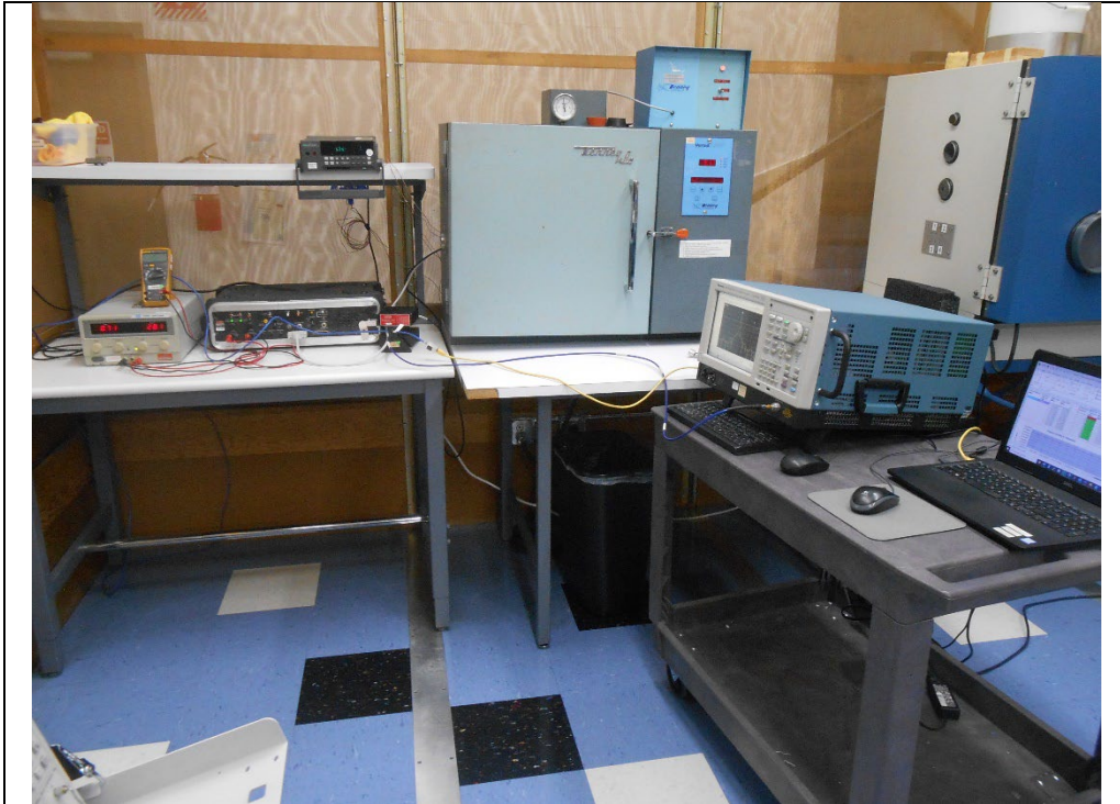
Frequency Stability #2