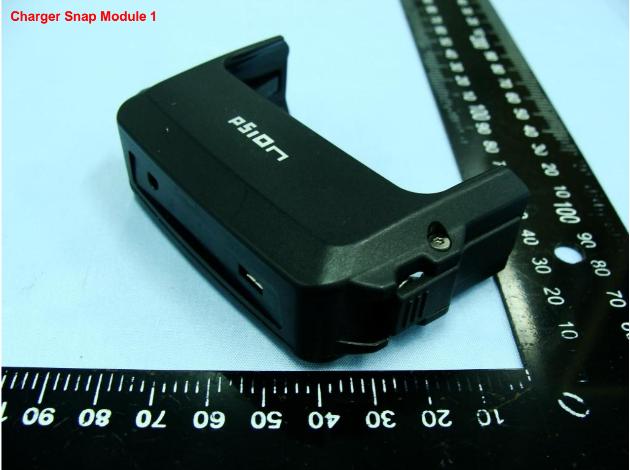
Charger Snap Module 1