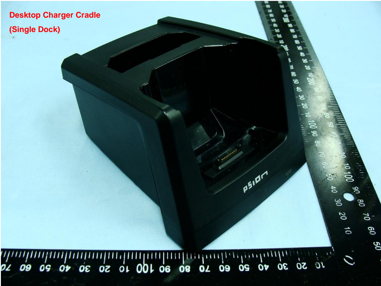
Desktop Charger Cradle (Single Dock)