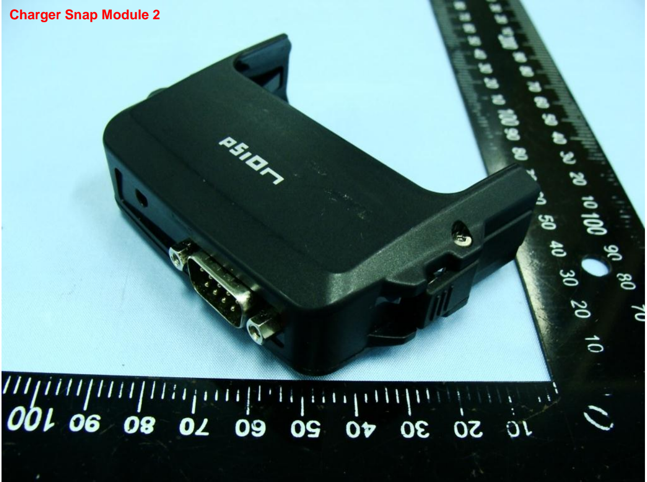
Charger Snap Module 2