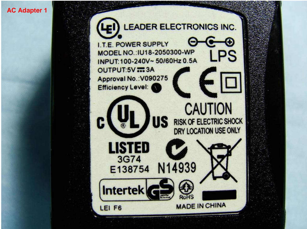
AC Adapter 1