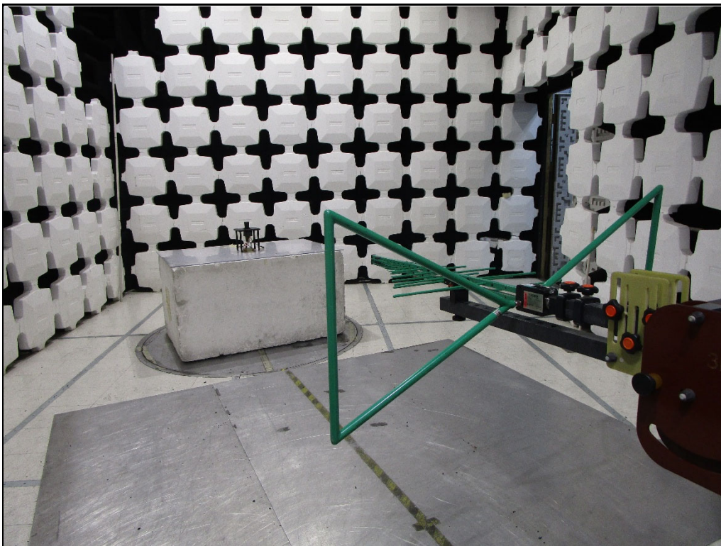
Test Setup for Spurious Radiated Emissions, 30MHz – 1GHz – Antenna Polarization Horizontal