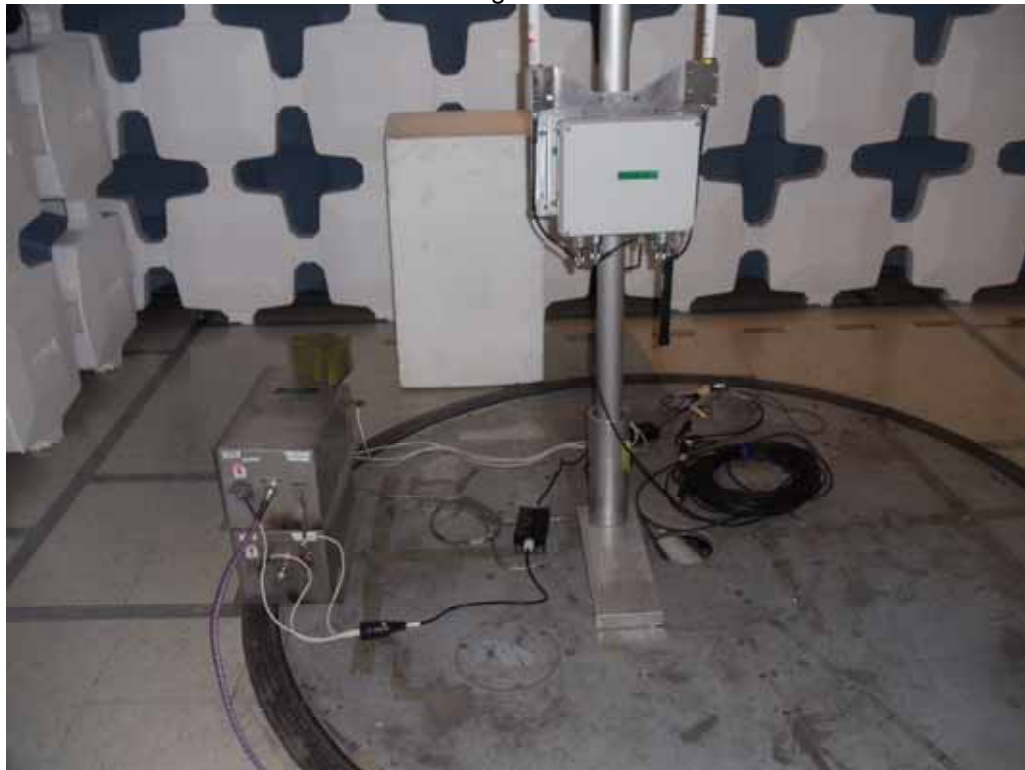
Test Setup for Conducted Emissions