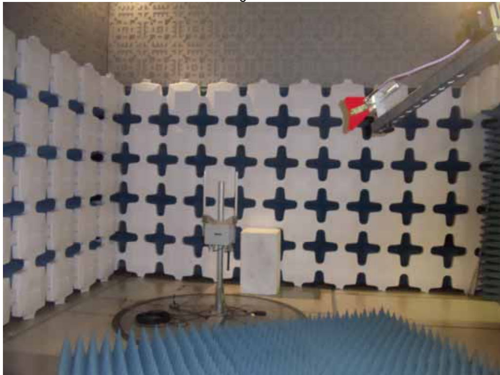
Test Setup for Radiated Emissions – 1 GHz to 10GHz, Horizontal Polarization