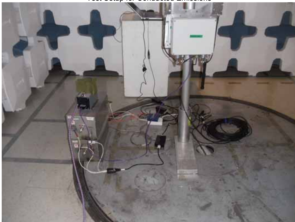
Test Setup for Conducted Emissions (L1)