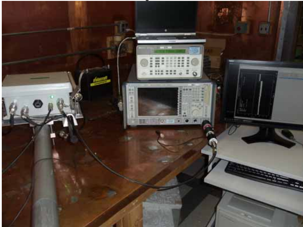
Direct Antenna Port Setup