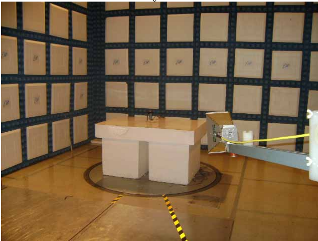
Test Setup for Radiated Emissions, Above 1GHz – Horizontal Polarization