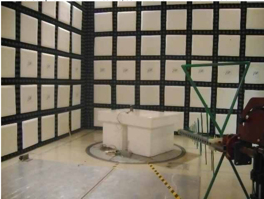
Test Setup for Radiated Emissions, 30MHz to 1GHz – Vertical Polarization