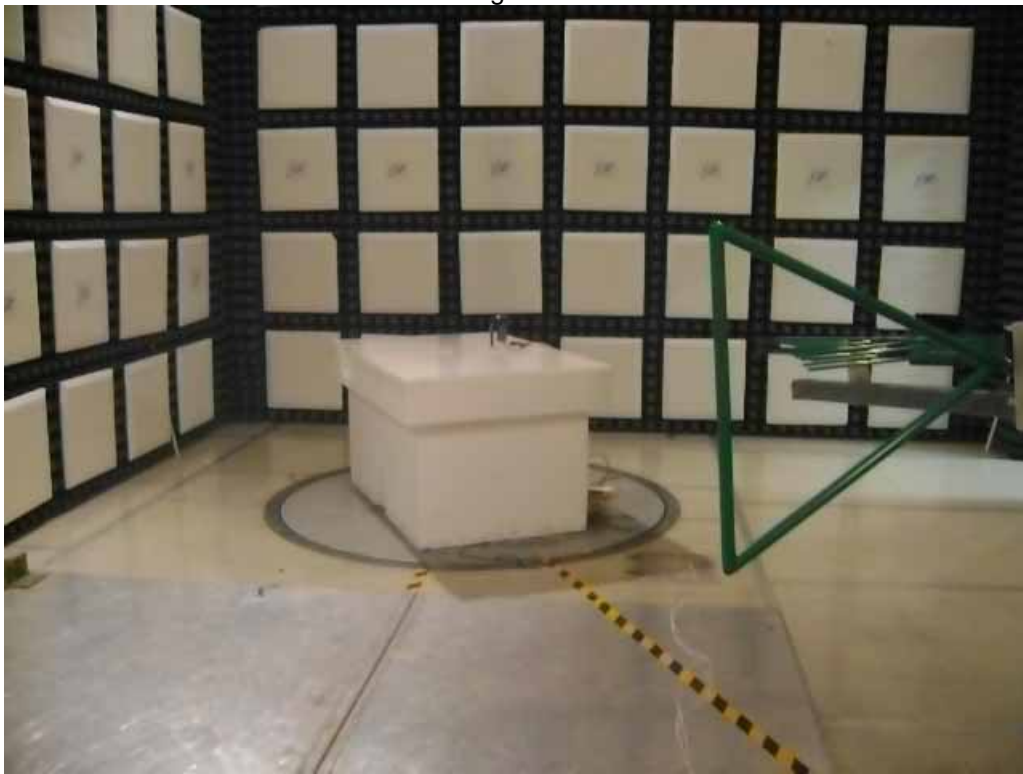
Test Setup for Radiated Emissions, 30MHz to 1GHz – Horizontal Polarization