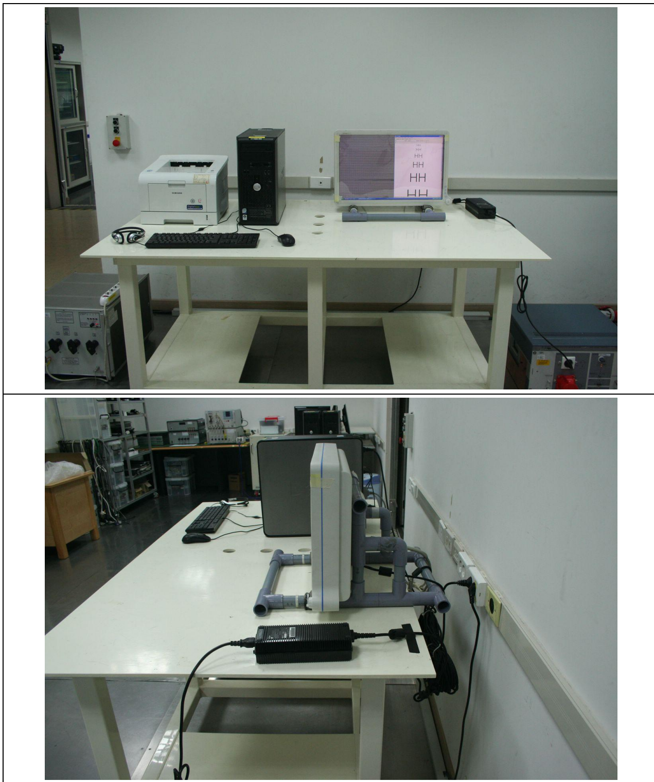
Figure 1. Conducted Emission Test Setup for DVI Mode: