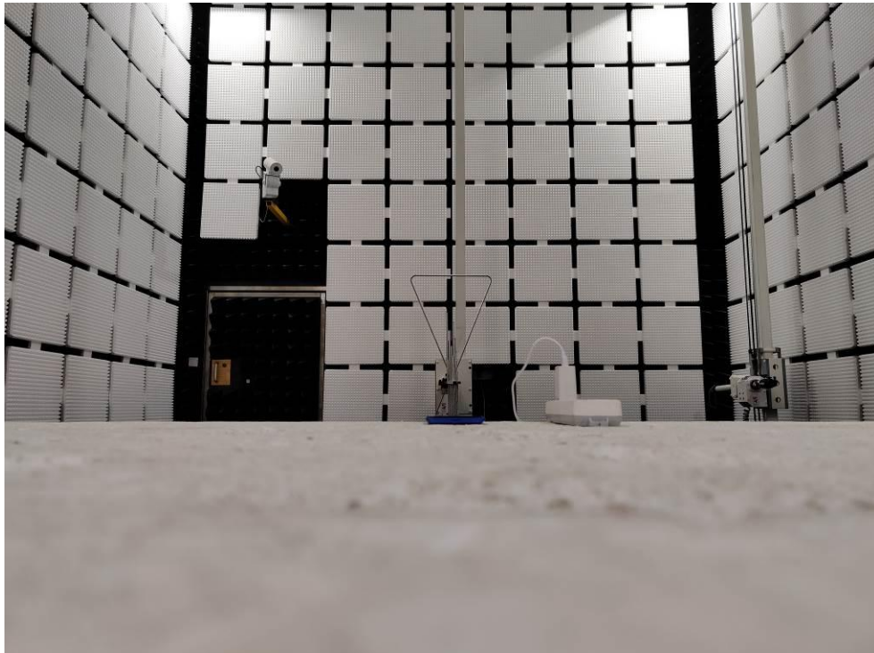
Fig. 1 (Below 1GHz)

Test Setup Photo(s) of Radiated Emissions Measurement