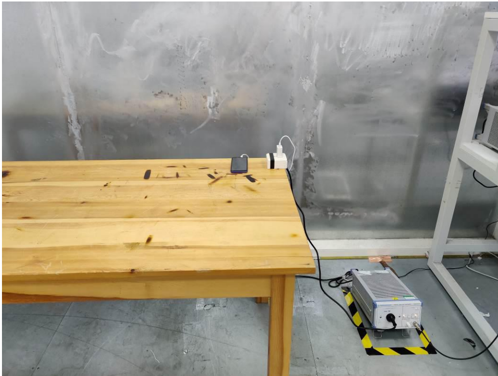
AC Conducted Emission of charge from power adapter mode