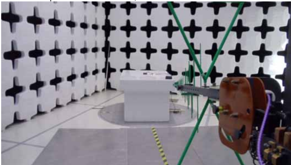
Test Setup for Radiated Emissions, 30MHz to 1GHz – Vertical Polarization