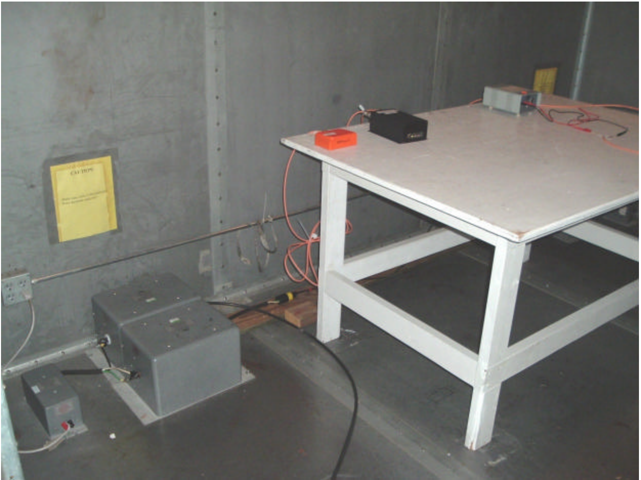
Photograph of Conducted Emissions, Transmitter and Digital Device