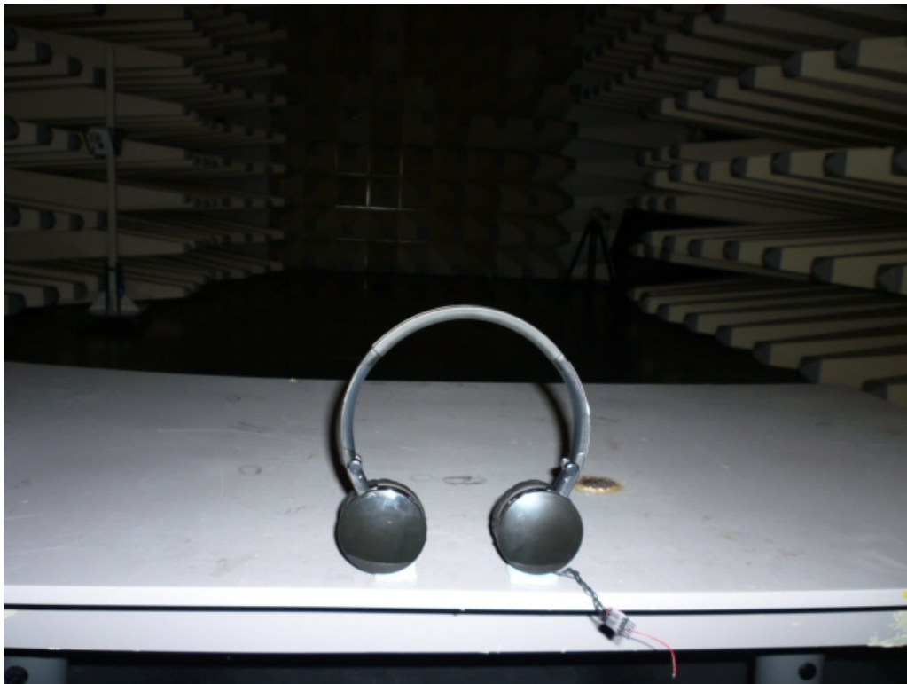
Setup for Radiated Emission