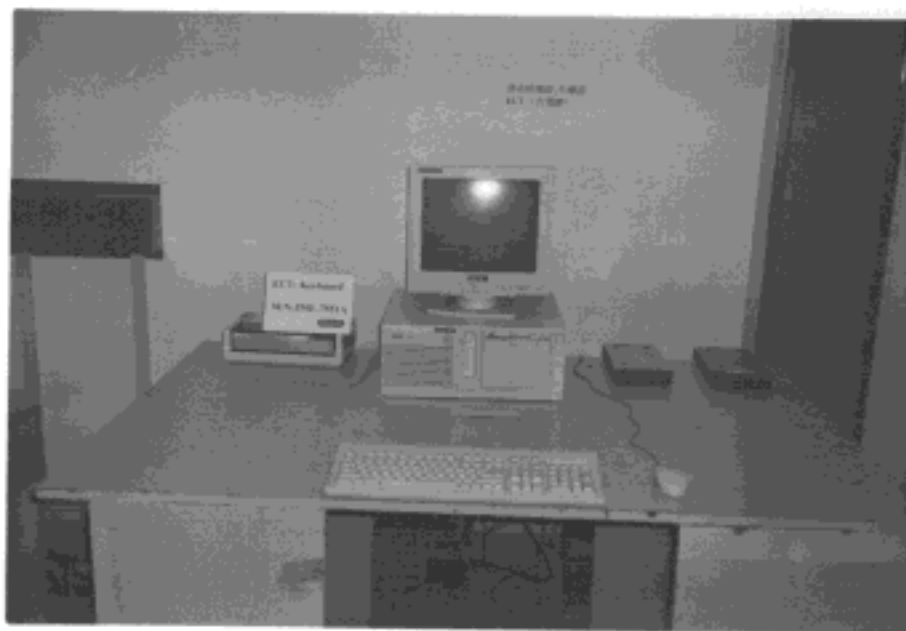
FRONT VIEW OF CONDUCTED MEASUREMENT