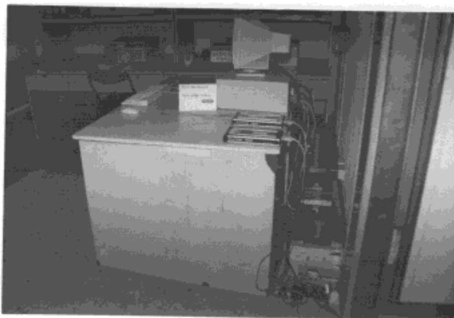
SIDE VIEW OF CONDUCTED MEASUREMENT