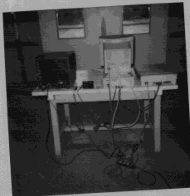
CONFIGURATION REAR VIEW