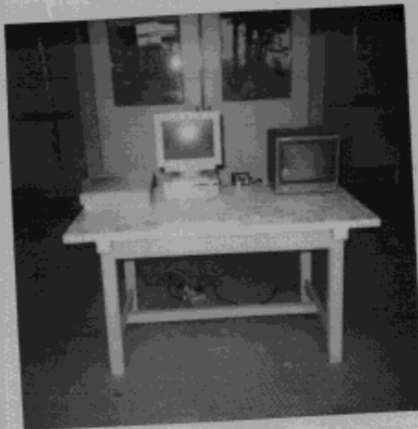
CONFIGURATION FRONT VIEW