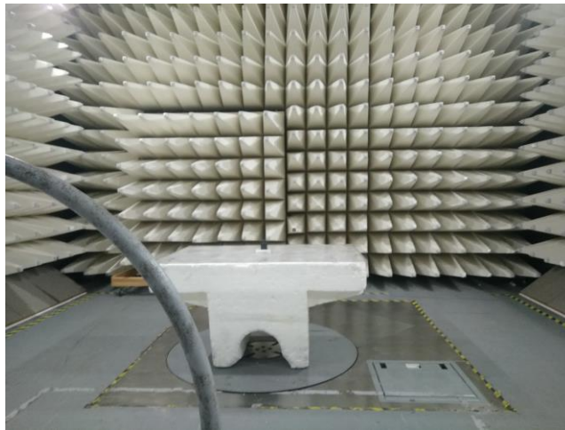
Photograph No.1 Setup for spurious field strength measurements in anechoic chamber from 9 kHz to 30 MHz