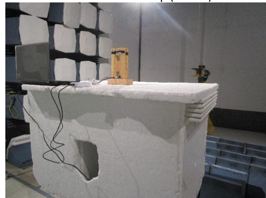
Radiated Emission Test setup (>1GHz) – Rear View