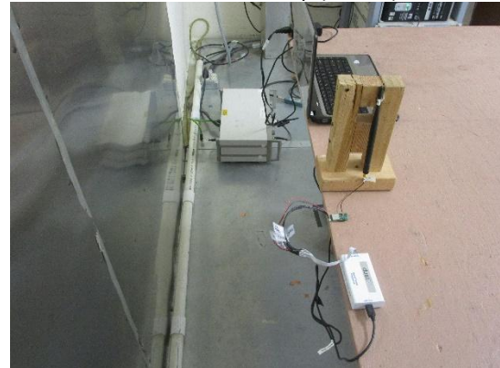
AC Line Conducted Emissions – Rear View

Note: The spurious emission in different EUT orientation was investigated, including the EUT standing up position and the laying down position. The EUT orientation shown in above setup photo is the worst case position.