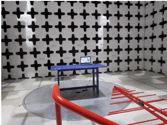
Radiated Emission Test setup (<1GHz) – Front View