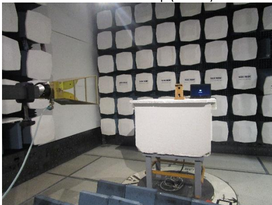
Radiated Emission Test setup (>1GHz) – Front View