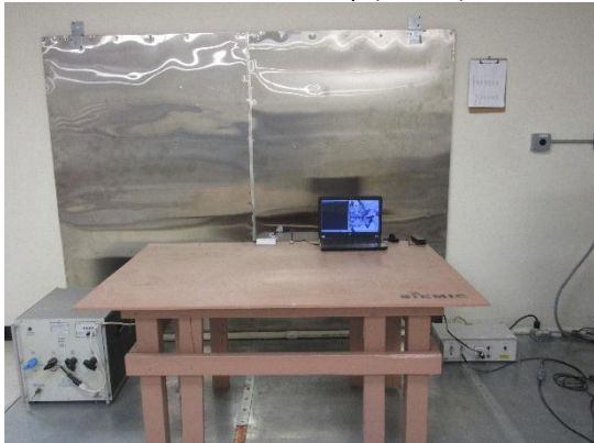
AC Line Conducted Emissions – Front View