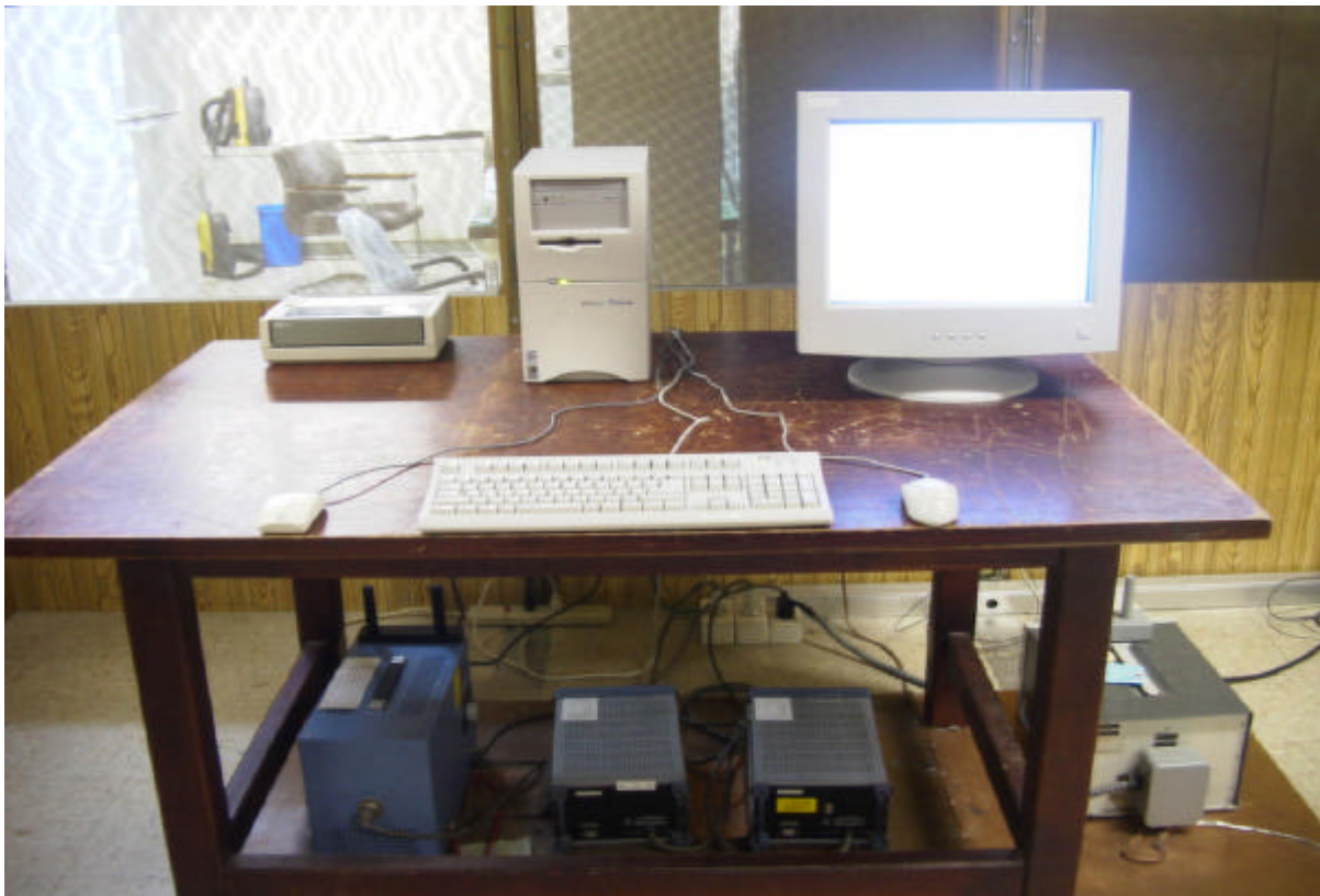
Conducted Emission 150kHz ~ 30MHz