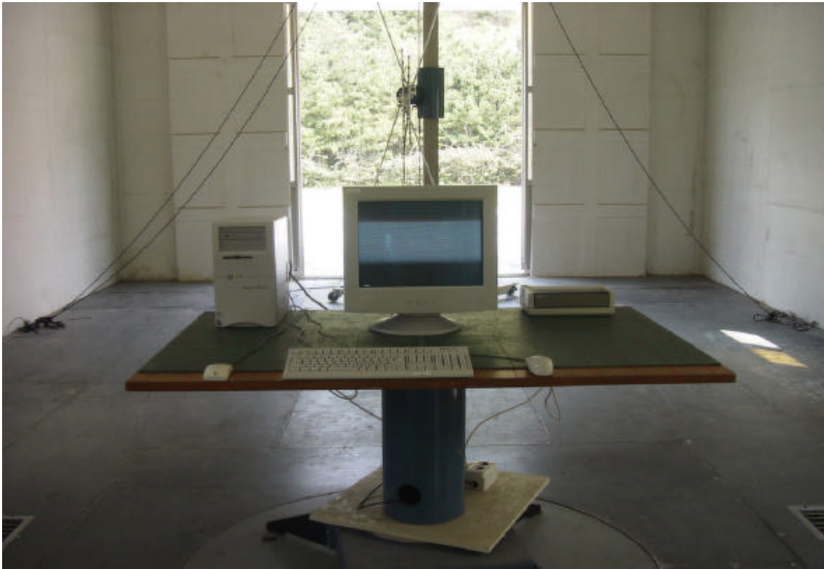
Radiated Emission 30MHz ~ 1000MHz