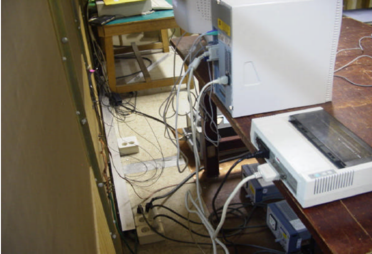
Conducted Emission 150kHz ~ 30MHz