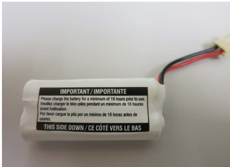
Figure 12 – 2.4V 300mAh Ni-MH Coslight rechargeable battery back view