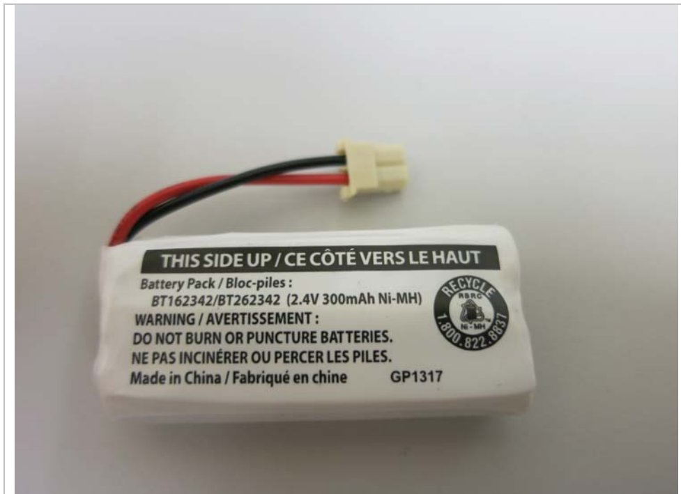
Figure 5 – 2.4V 300mAh Ni-MH GPI rechargeable battery front view