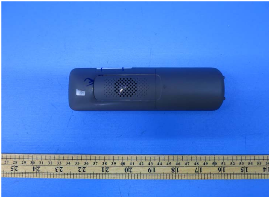
Figure 2 – Handset Unit back view