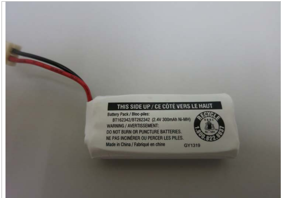
Figure 11 – 2.4V 300mAh Ni-MH Coslight rechargeable battery front view