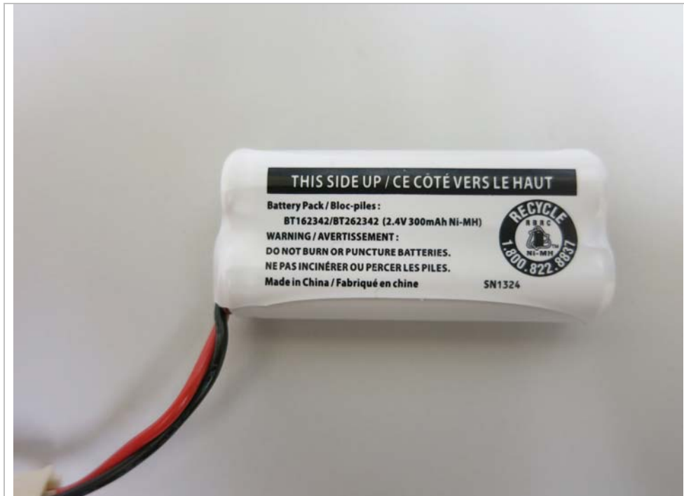
Figure 9 – 2.4V 300mAh Ni-MH Sanik rechargeable battery front view