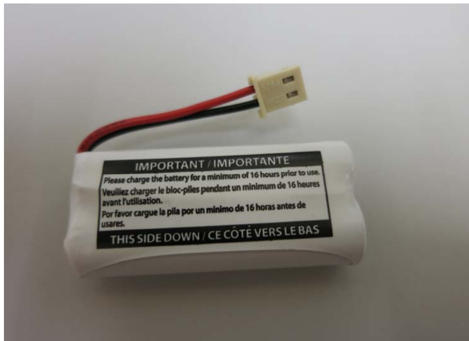
Figure 4 – 2.4V 300mAh Ni-MH Corun rechargeable battery back view