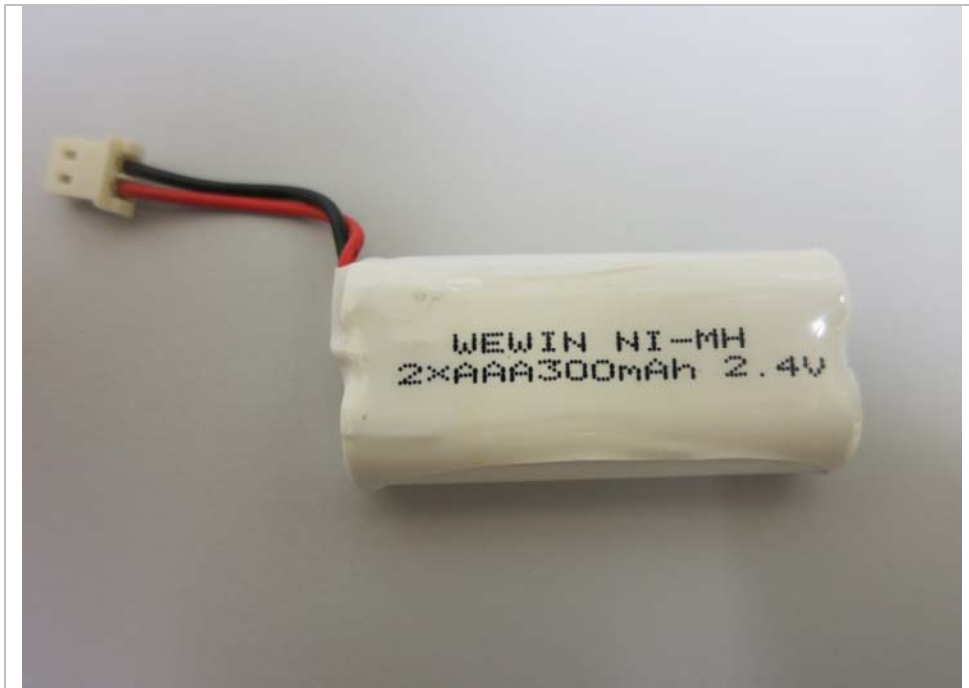
Figure 7 – 2.4V 300mAh Ni-MH Wewin rechargeable battery front view