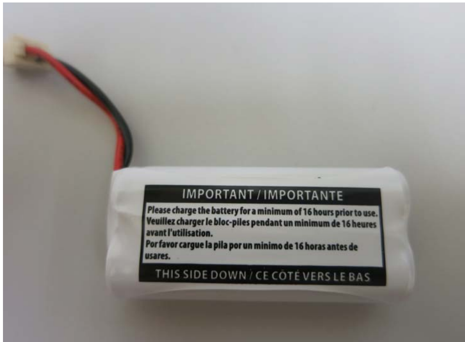
Figure 10 – 2.4V 300mAh Ni-MH Sanik rechargeable battery back view