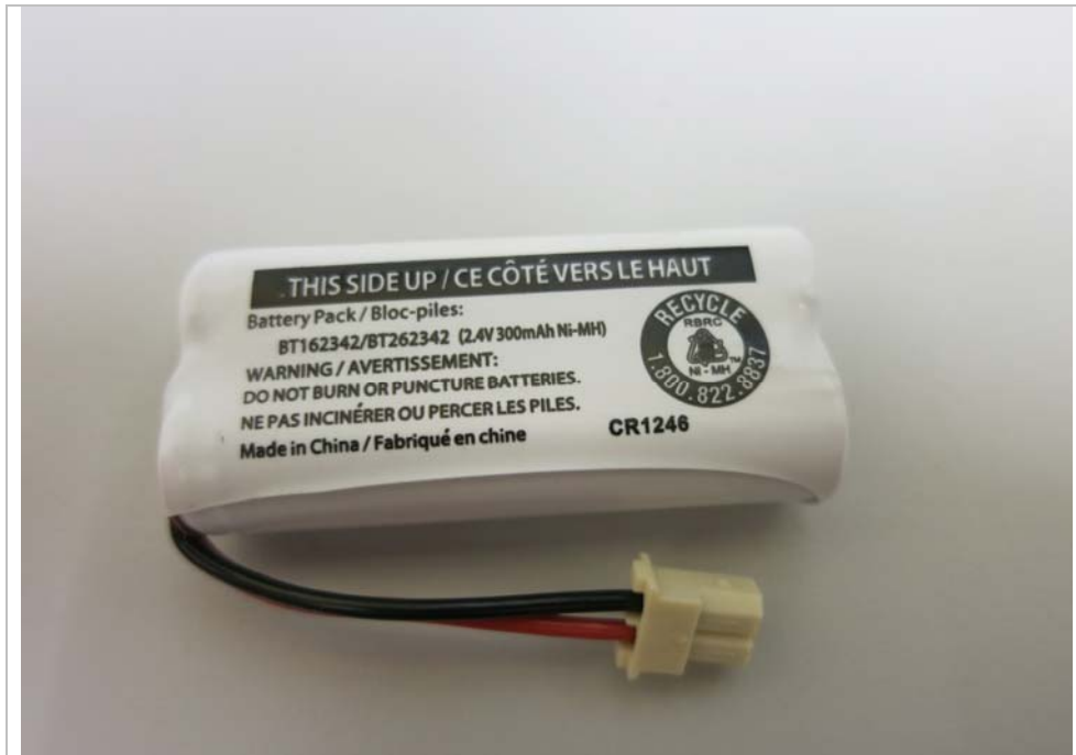
Figure 3 – 2.4V 300mAh Ni-MH Corun rechargeable battery front view