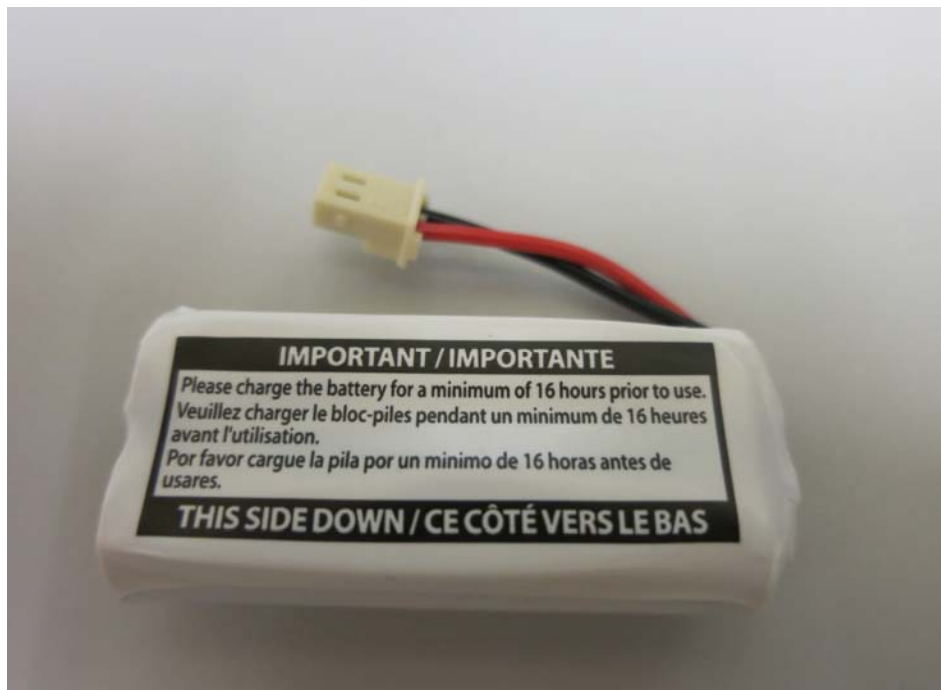
Figure 6 – 2.4V 300mAh Ni-MH GPI rechargeable battery back view