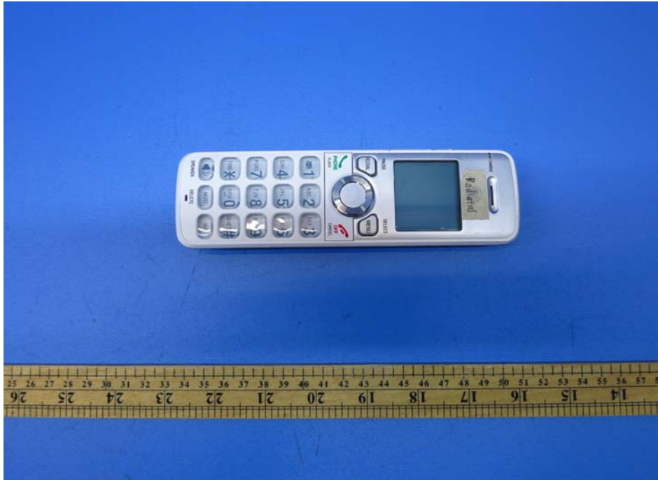
Figure 1 – Handset Unit front view