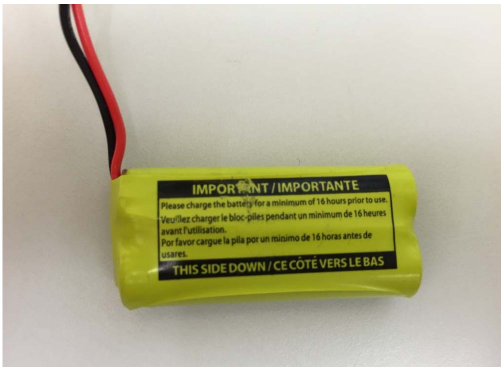
Figure 6 – 2.4V 400mAh Ni-MH Corun rechargeable battery back view