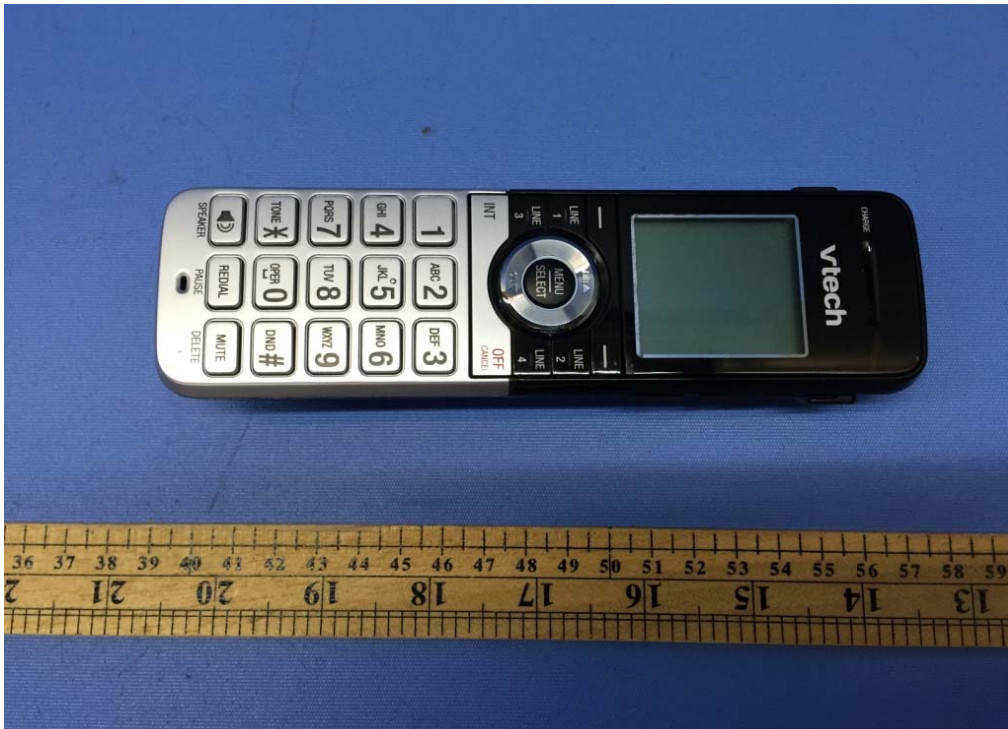
Figure 1 – Handset Unit front view