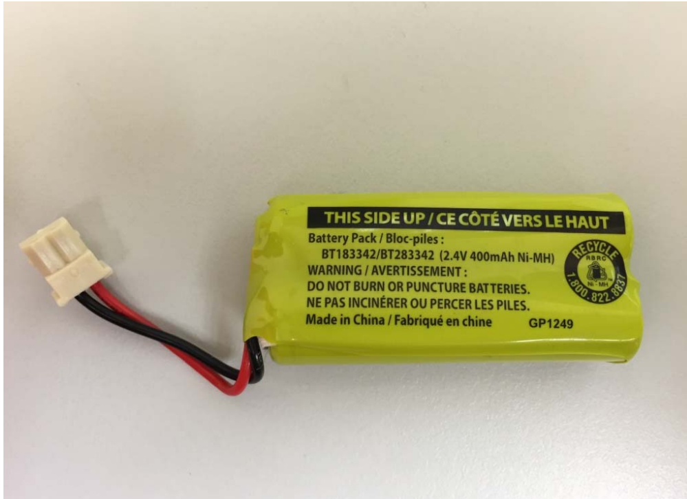
Figure 7 – 2.4V 400mAh Ni-MH GPI rechargeable battery front view