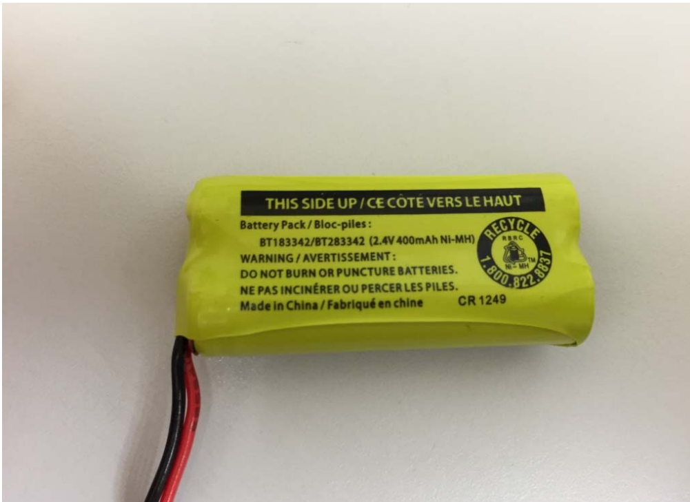
Figure 5 – 2.4V 400mAh Ni-MH Corun rechargeable battery front view