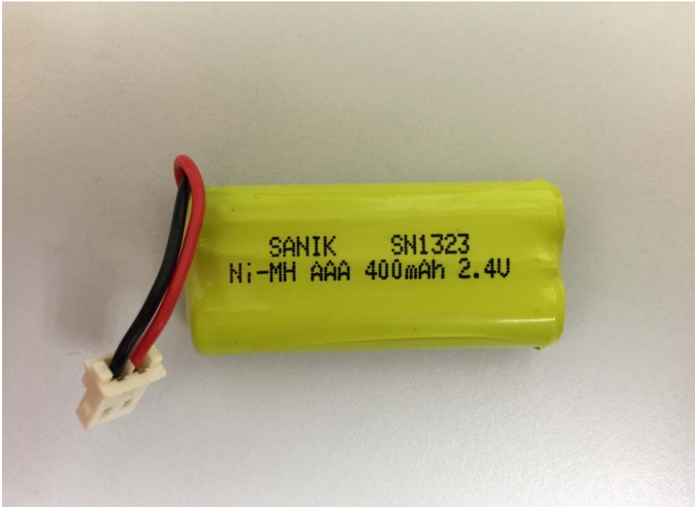
Figure 11 – 2.4V 400mAh Ni-MH Sanik rechargeable battery front view