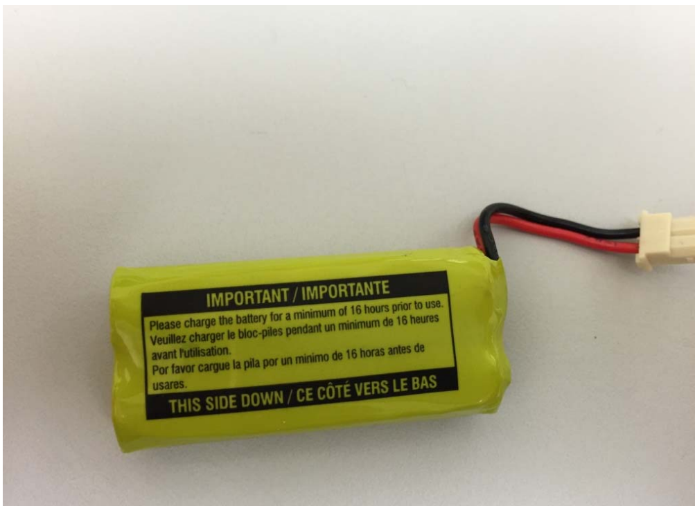
Figure 10 – 2.4V 400mAh Ni-MH Coslight rechargeable battery back view