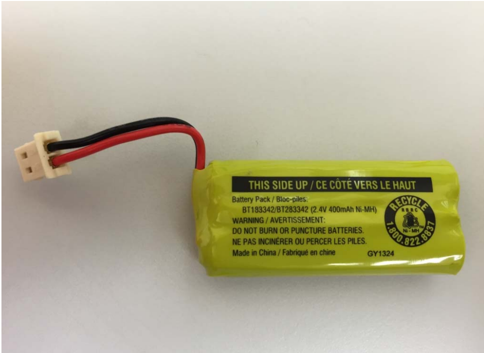
Figure 9 – 2.4V 400mAh Ni-MH Coslight rechargeable battery front view