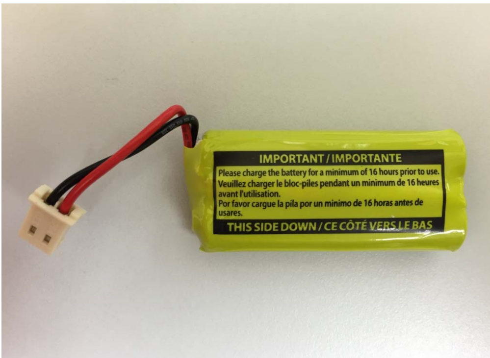
Figure 8 – 2.4V 400mAh Ni-MH GPI rechargeable battery back view