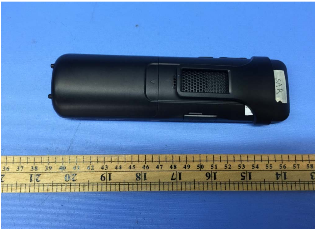
Figure 2 – Handset Unit back view