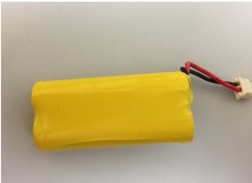
Figure 4 – 2.4V 400mAh Ni-MH Wewin rechargeable battery back view