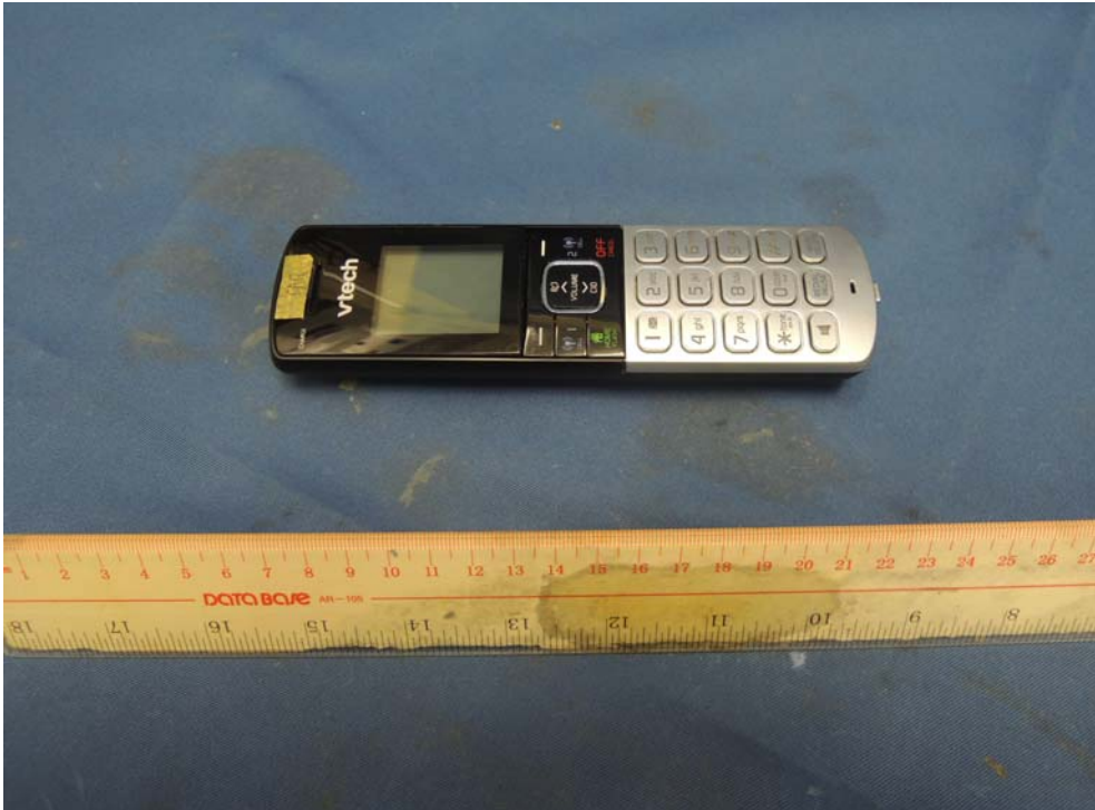
Figure 1 – Handset Unit front view