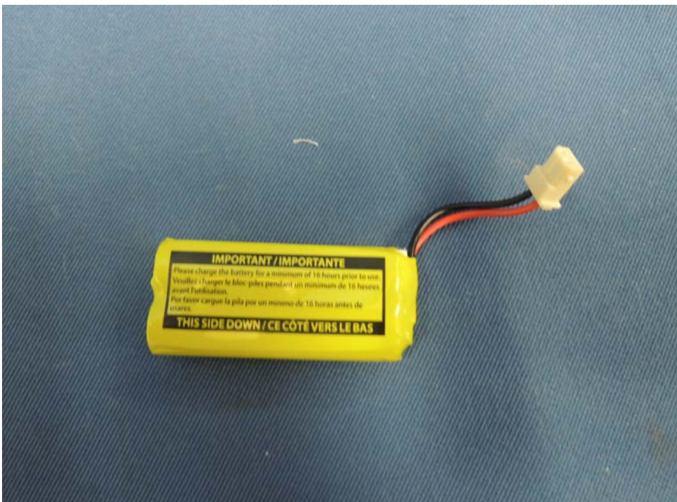
Figure 6 – 2.4V 400mAh Ni-MH GPI rechargeable battery back view