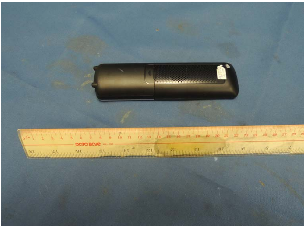
Figure 2 – Handset Unit back view