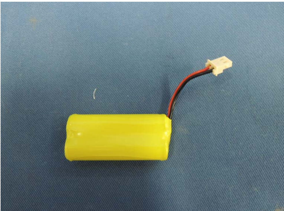
Figure 10 – 2.4V 400mAh Ni-MH Sanik rechargeable battery back view