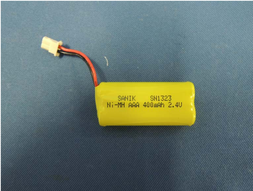
Figure 9 – 2.4V 400mAh Ni-MH Sanik rechargeable battery front view