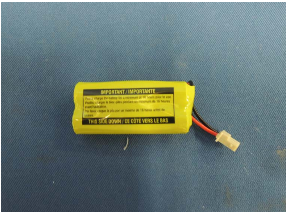
Figure 12 – 2.4V 400mAh Ni-MH Coslight rechargeable battery back view