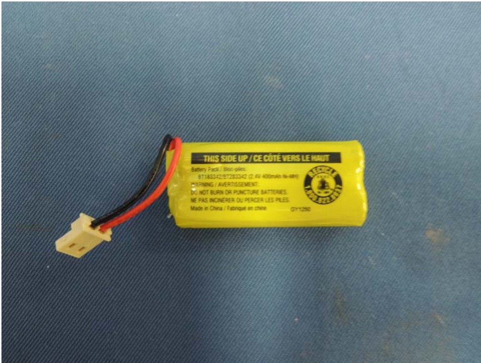
Figure 11 – 2.4V 400mAh Ni-MH Coslight rechargeable battery front view