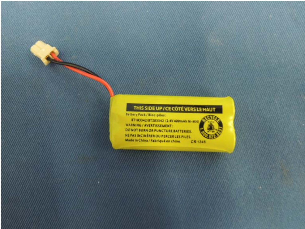
Figure 7 – 2.4V 400mAh Ni-MH Courn rechargeable battery front view