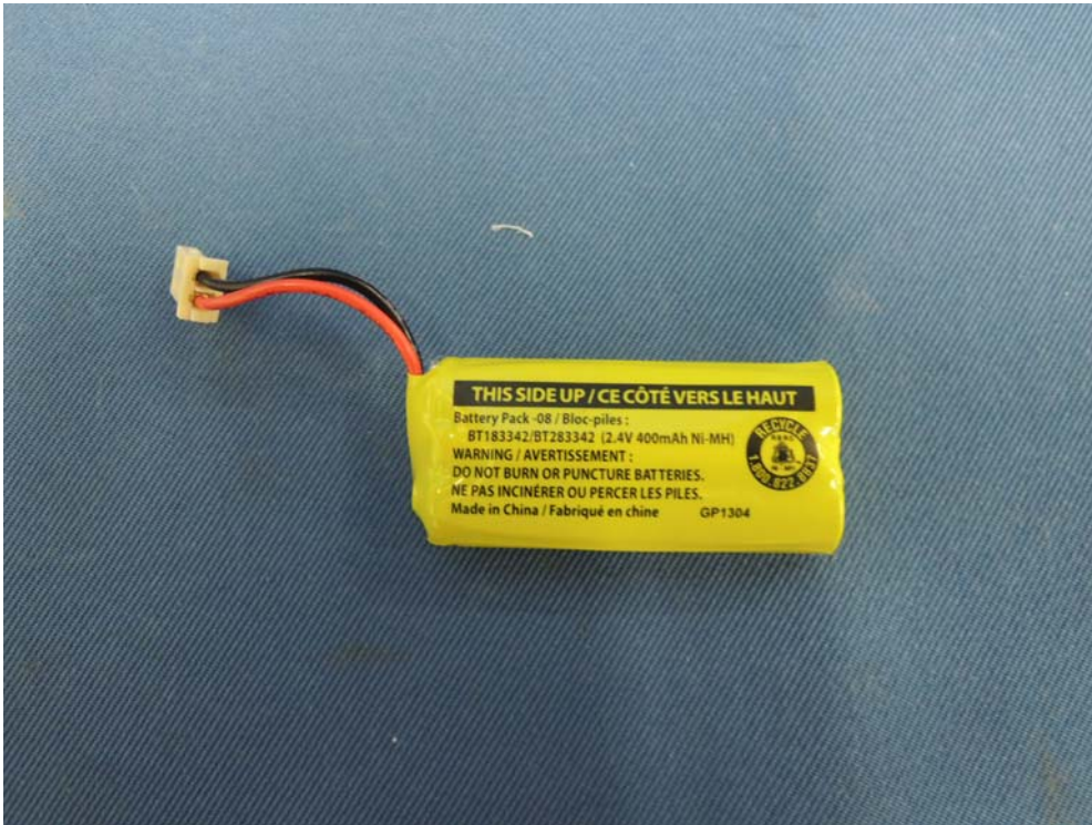
Figure 5 – 2.4V 400mAh Ni-MH GPI rechargeable battery front view