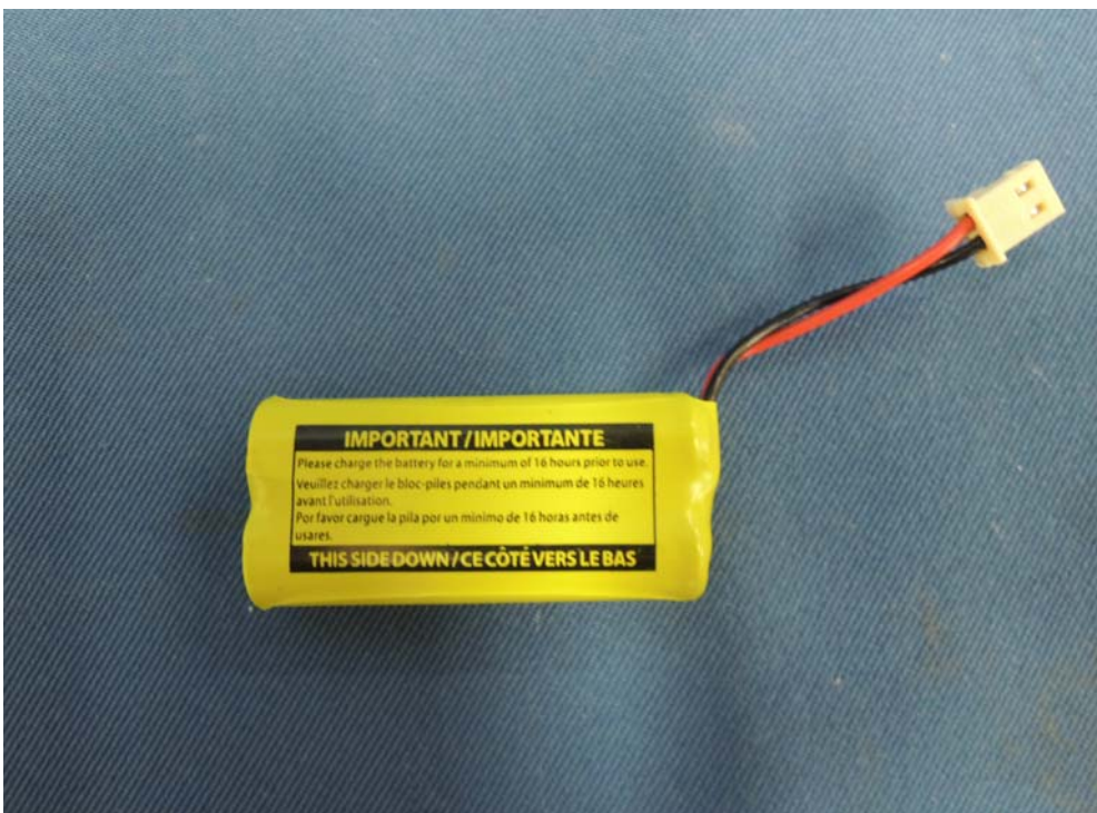
Figure 8 – 2.4V 400mAh Ni-MH Courn rechargeable battery back view