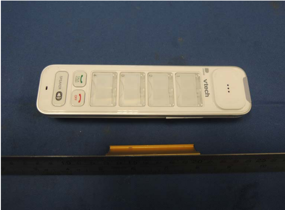
Figure 1 – Handset Unit front view