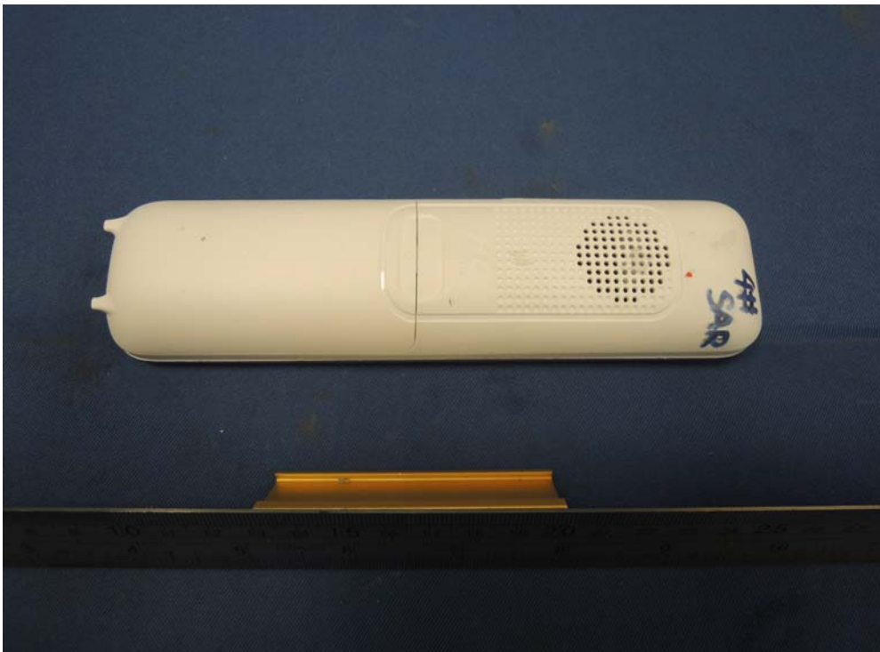
Figure 2 – Handset Unit back view