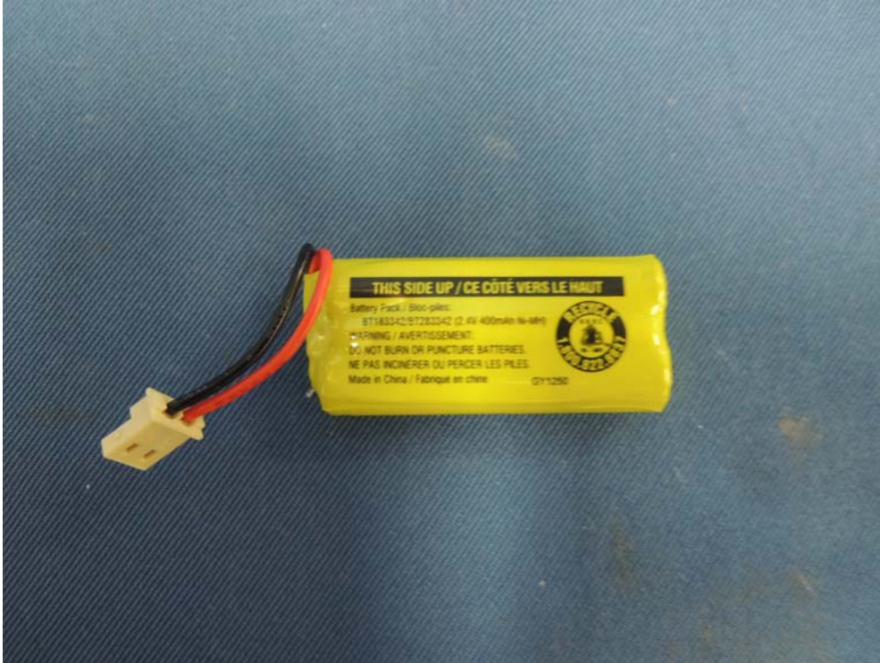
Figure 11 – 2.4V 400mAh Ni-MH Coslight rechargeable battery front view