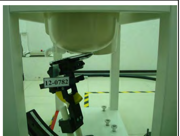
Figure 5. Left Head SAR Test Setup (Tilted)