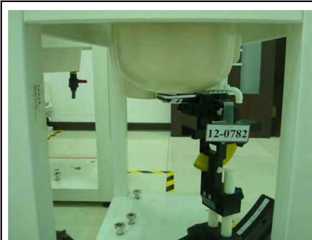
Figure 2. Right Head SAR Test Setup (Cheek)