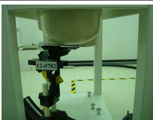
Figure 4. Left Head SAR Test Setup (Cheek)