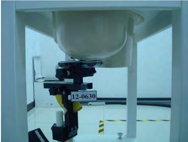
Figure 4. Left Head SAR Test Setup (Cheek)