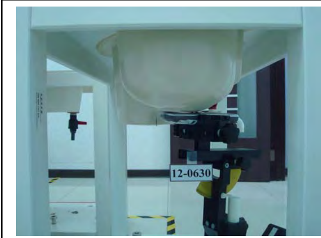
Figure 2. Right Head SAR Test Setup (Cheek)