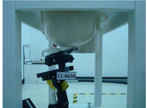
Figure 5. Left Head SAR Test Setup (Tilted)