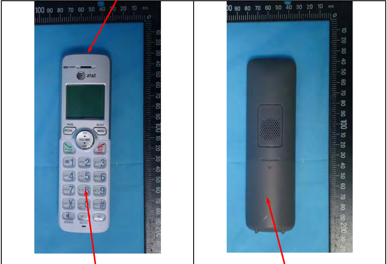
EUT Front side