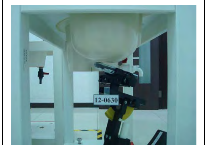
Figure 3. Right Head SAR Test Setup (Tilted)