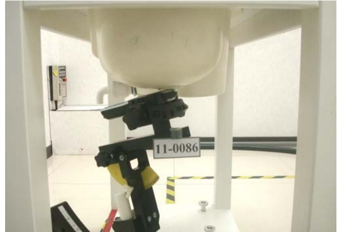
Figure 5. Left Head SAR Test Setup (Tilted)