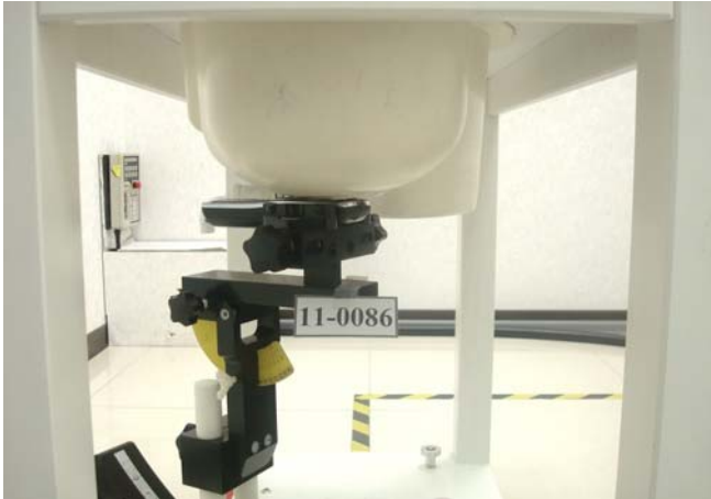
Figure 4. Left Head SAR Test Setup (Cheek)