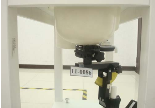
Figure 2. Right Head SAR Test Setup (Cheek)