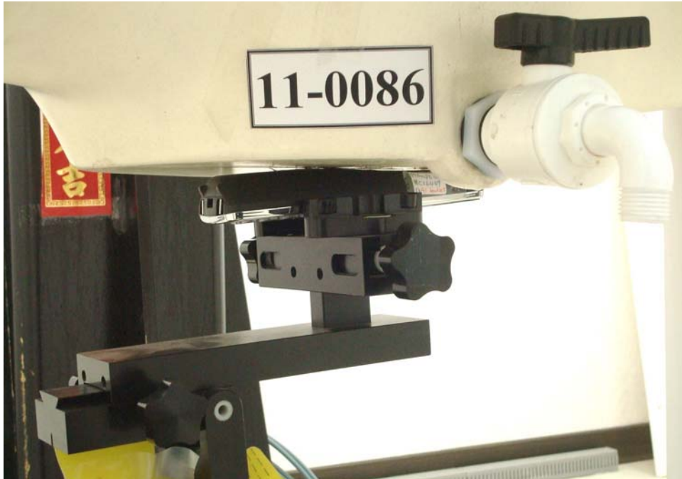
Figure 6. Body SAR Test Setup (Flat Section)