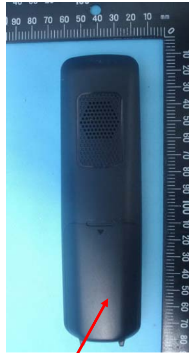
EUT Front side