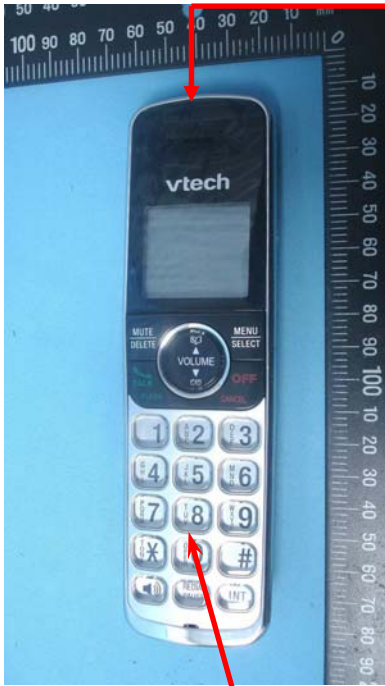
EUT Top side