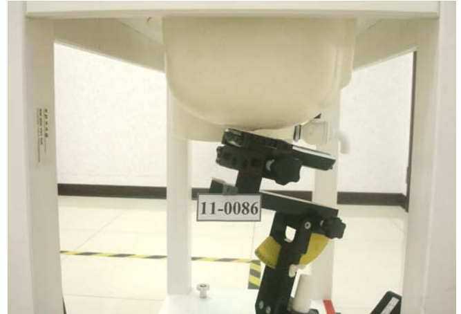
Figure 3. Right Head SAR Test Setup (Tilted)