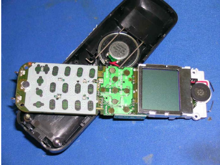
Handset Main PCB display side (View 2)