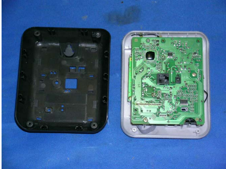
Base Unit Main PCB comp side (View 1)