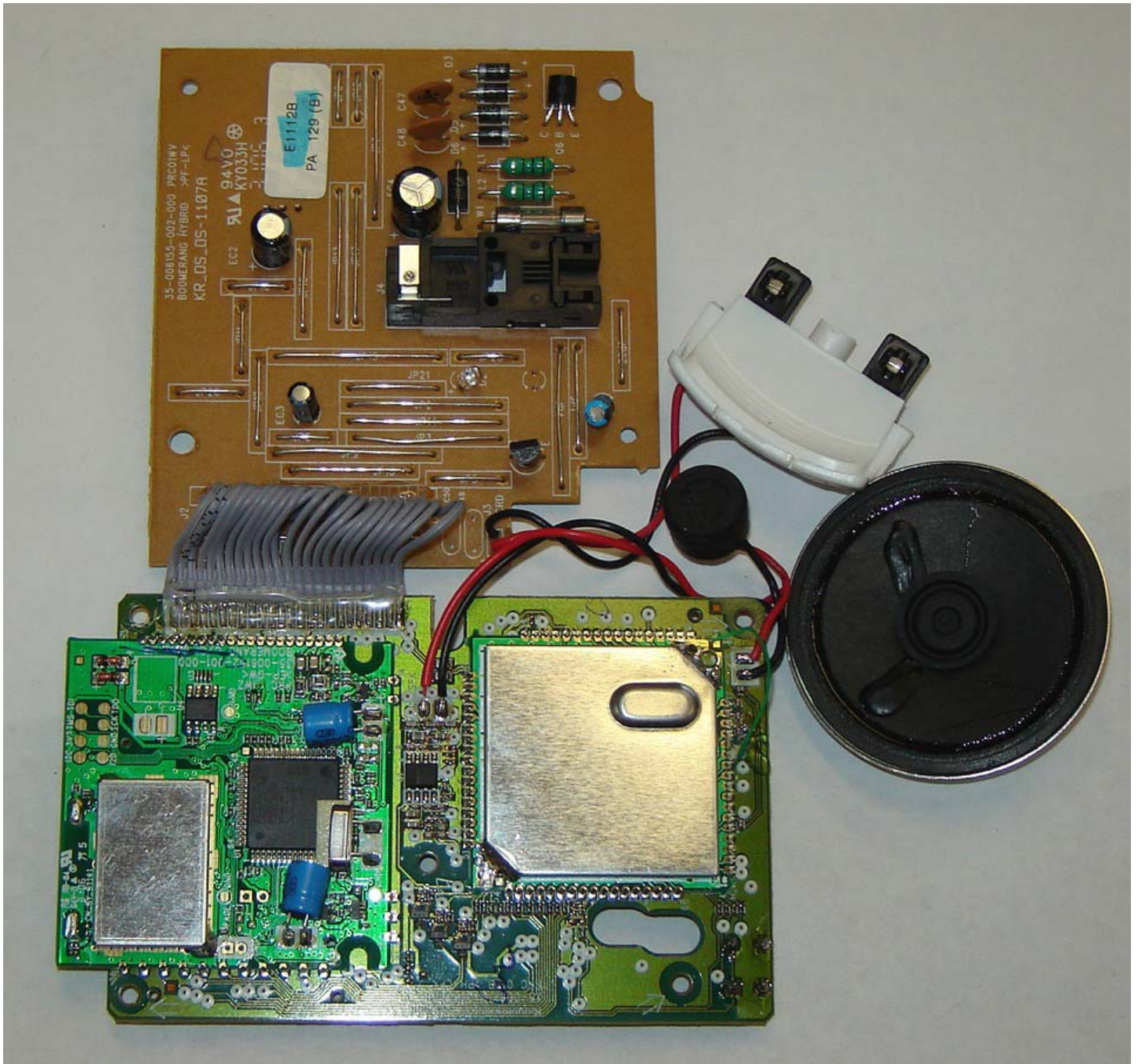
AT&T E2811 Base PCB