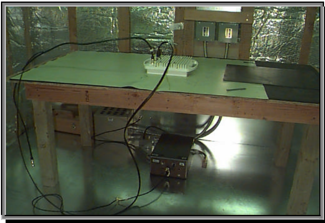
15.205-15.209 CONDUCTED EMISSIONS