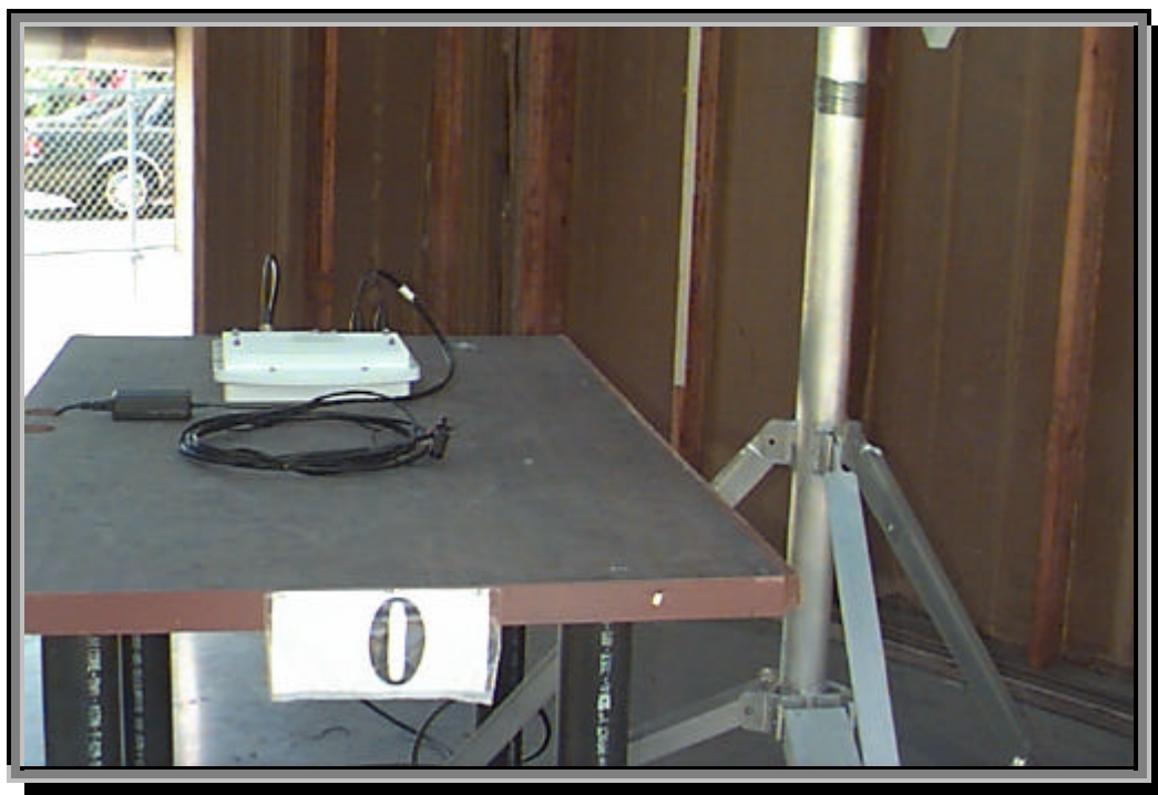
15.205, 15.209. RADIATED EMISSIONS (OATS)