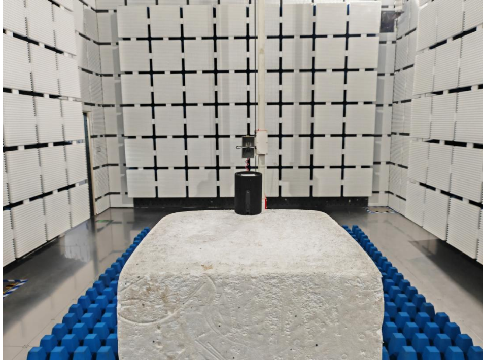
Radiated Emissions (above 1GHz)