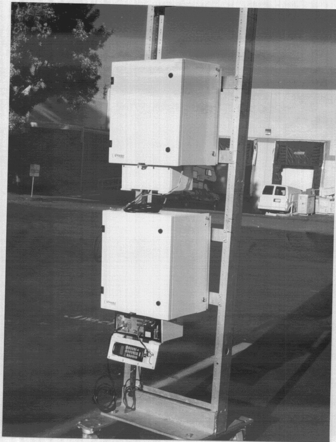
Front view of OA1900C NR, two channels. Primary enclosure (ch. 1) on bottom; Growth enclosure (ch. 2) on top.