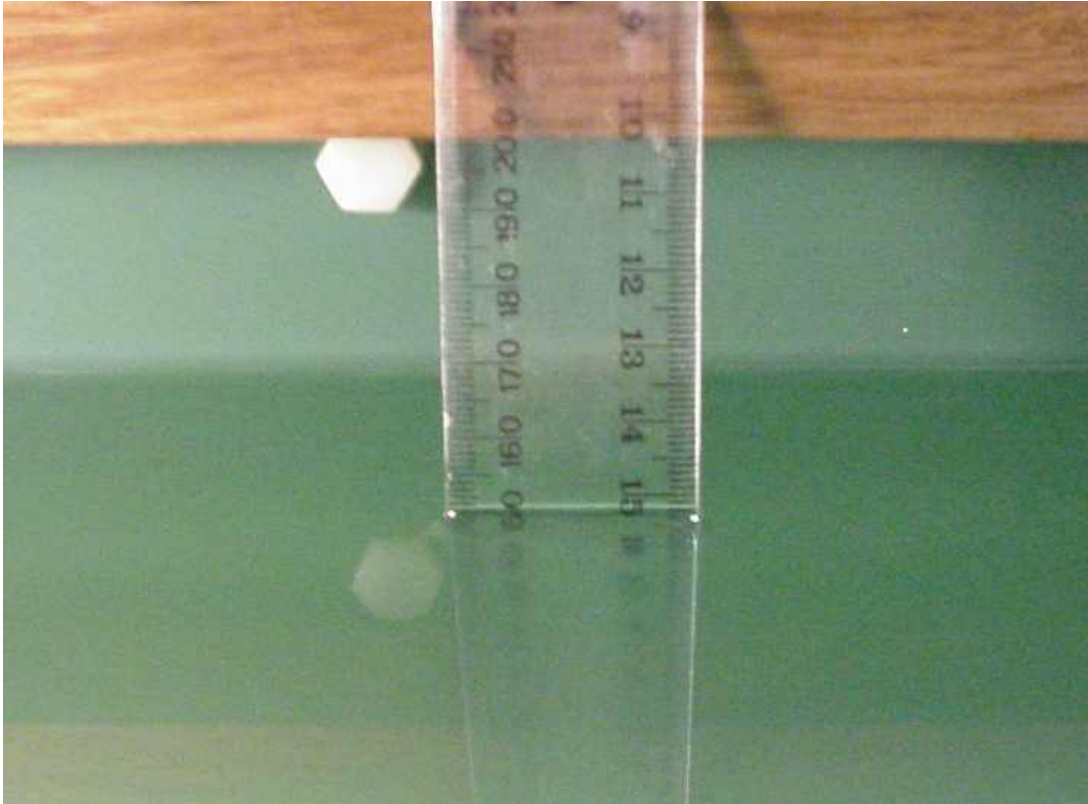
Photo of liquid Depth in Flat Phantom

During the SAR measurement process the liquid level was maintained to a level of 15cm with a tolerance of 0.5cm.