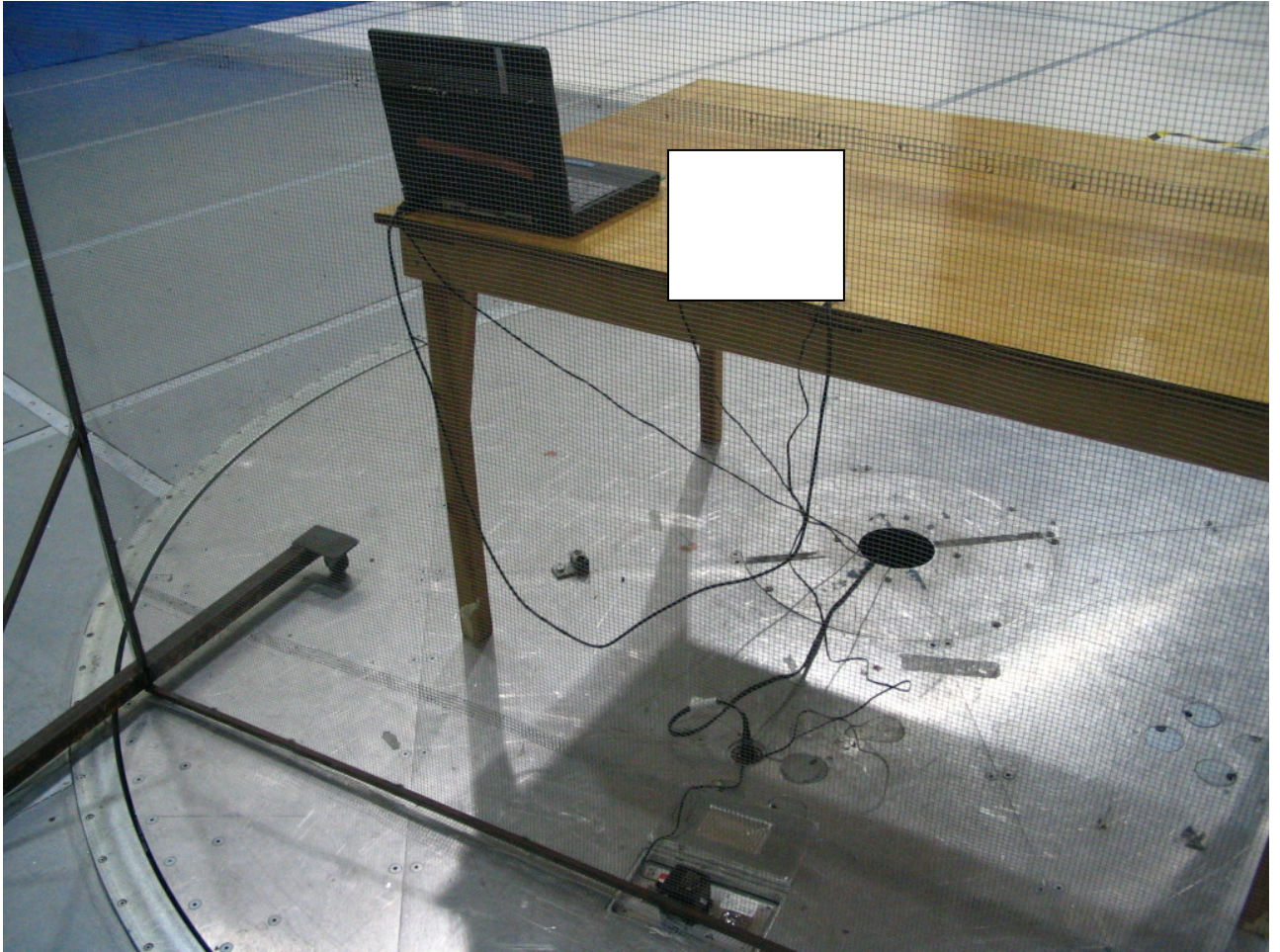
Figure 4: Conducted Emissions Testing