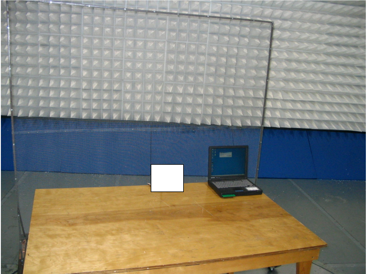
Figure 3: Conducted Emissions Testing