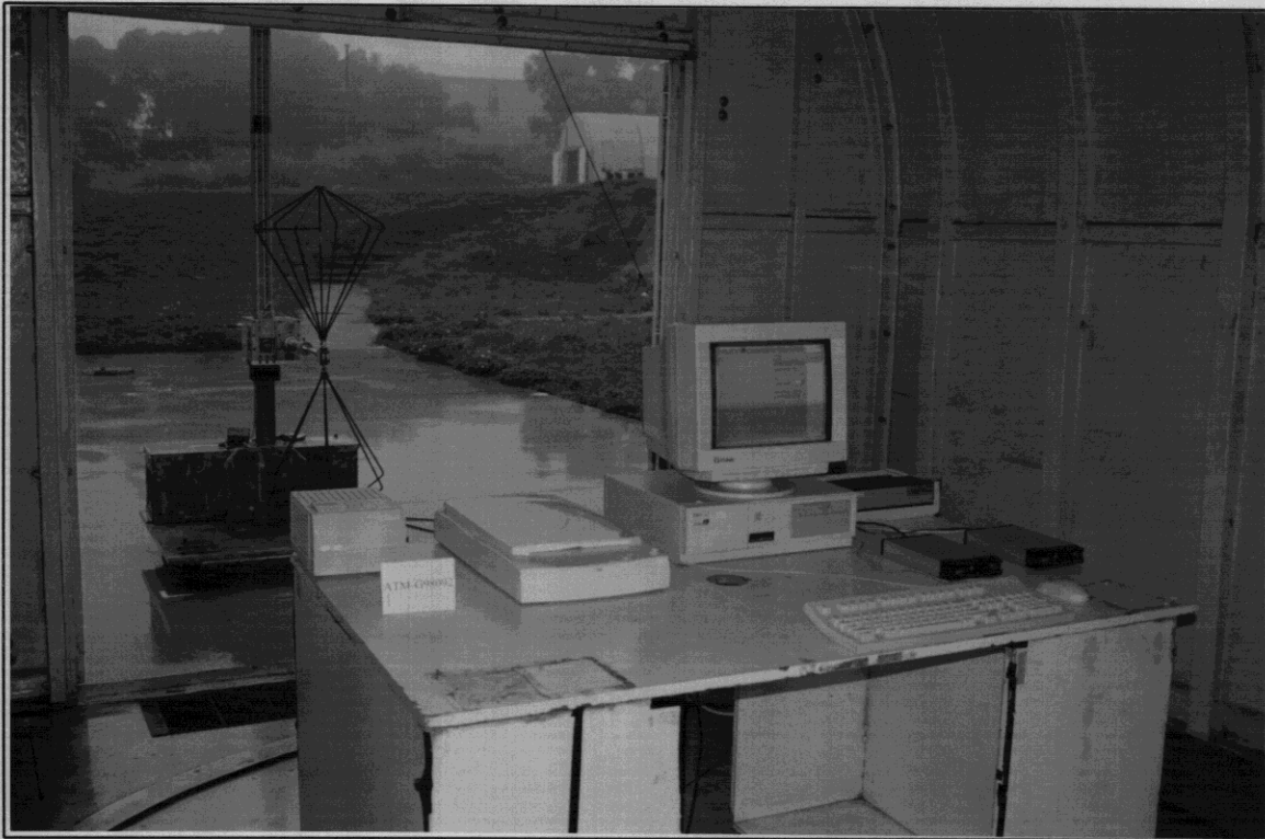
FRONT VIEW OF RADIATED TEST