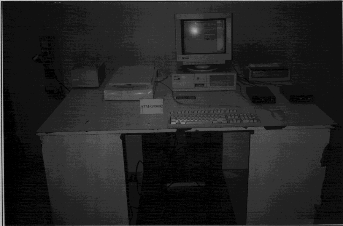
FRONT VIEW OF CONDUCTED TEST