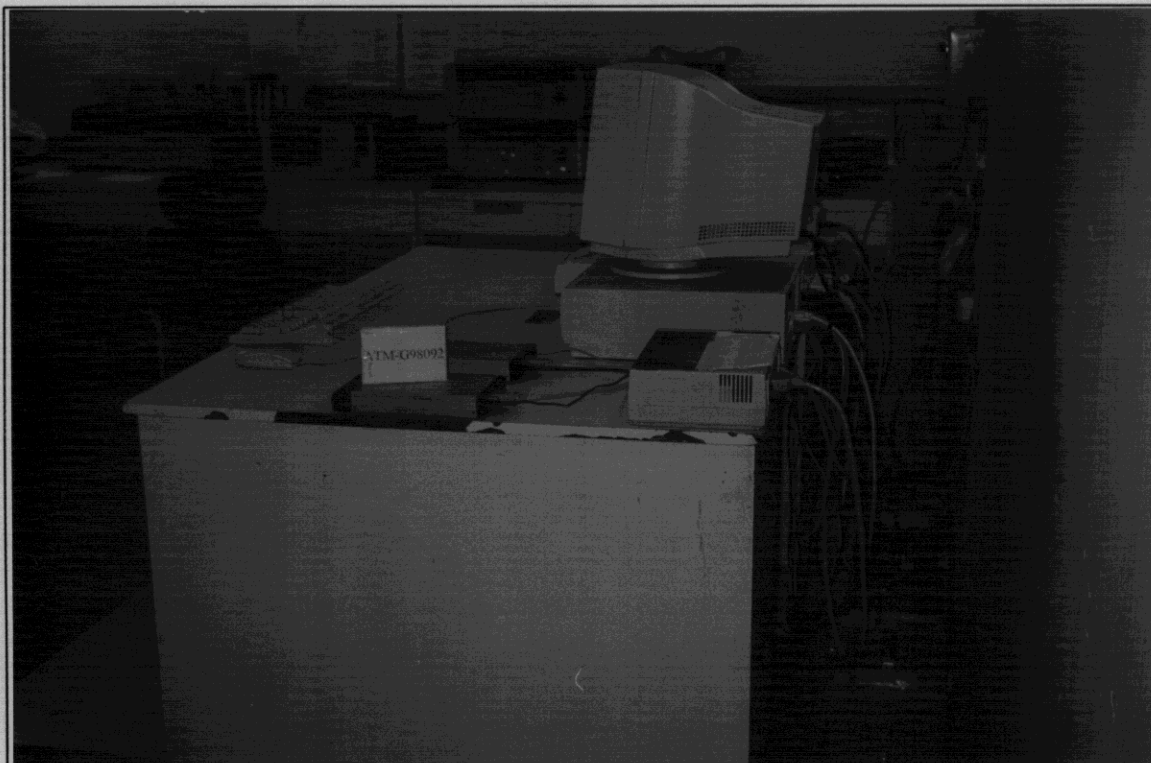
BACK VIEW OF CONDUCTED TEST