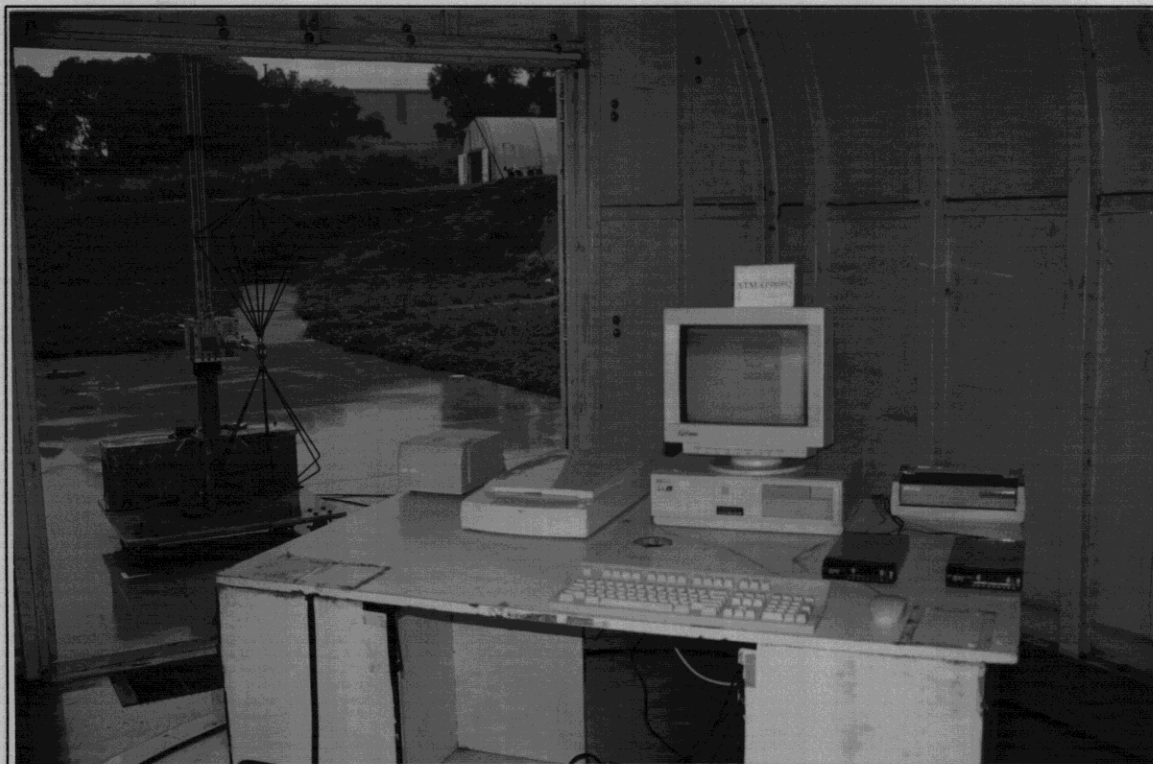
SETUP WITH MAXIMUM DETECTED EMISSION AT VERTICAL POLARIZATION