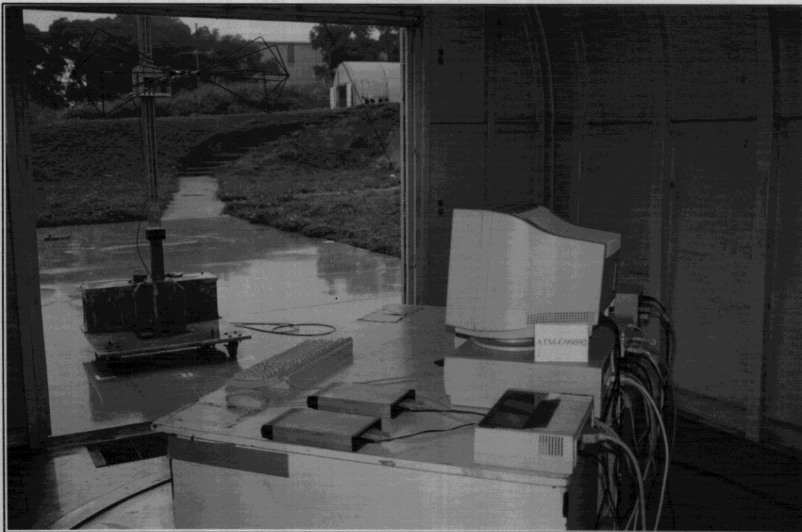
SETUP WITH MAXIMUM DETECTED EMISSION AT HORIZONTAL POLARIZATION