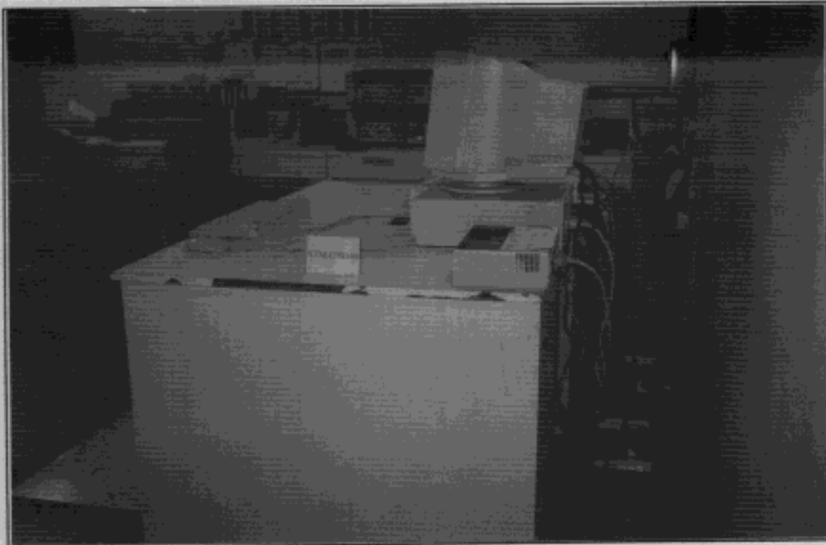
BACK VIEW OF CONDUCTED TEST