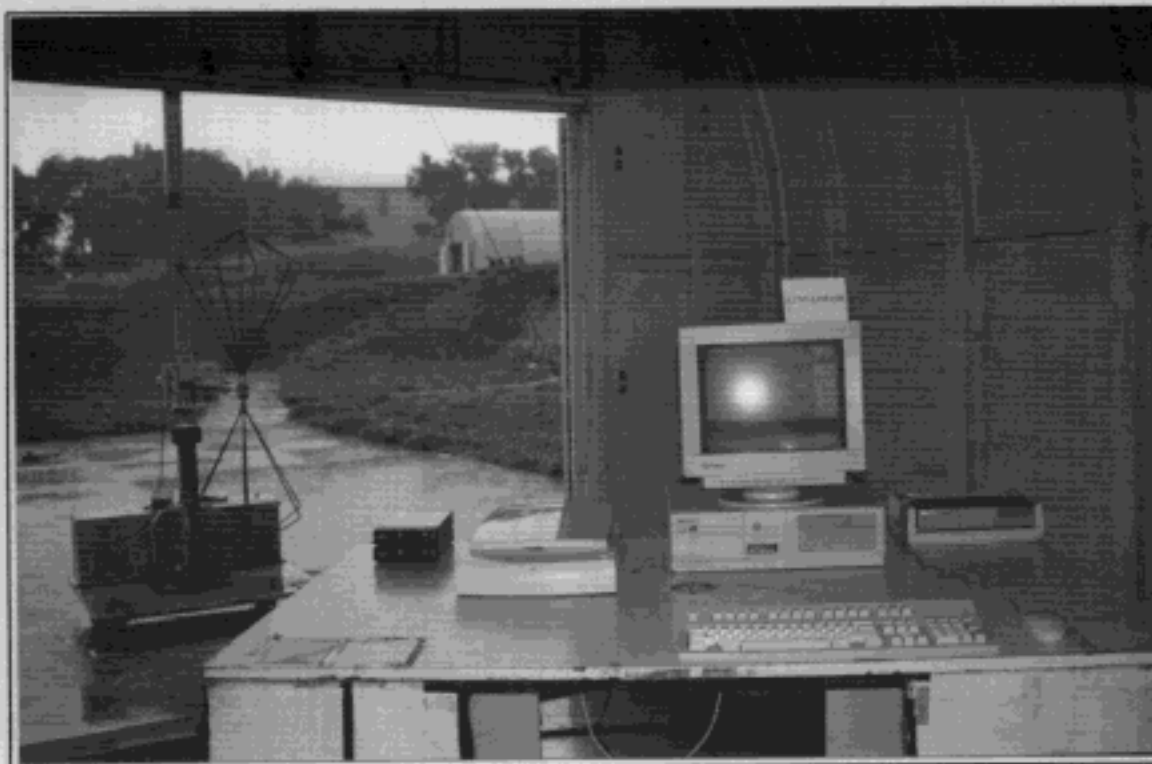
SETUP WITH MAXIMUM DETECTED EMISSION AT VERTICAL POLARIZATION