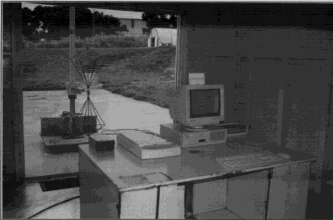
FRONT VIEW OF RADIATED TEST