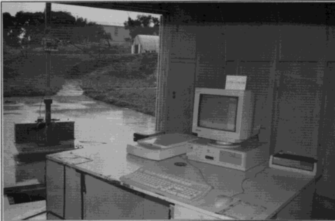
SETUP WITH MAXIMUM DETECTED EMISSION AT HORIZONTAL POLARIZATION