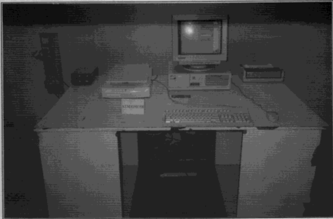
FRONT VIEW OF CONDUCTED TEST