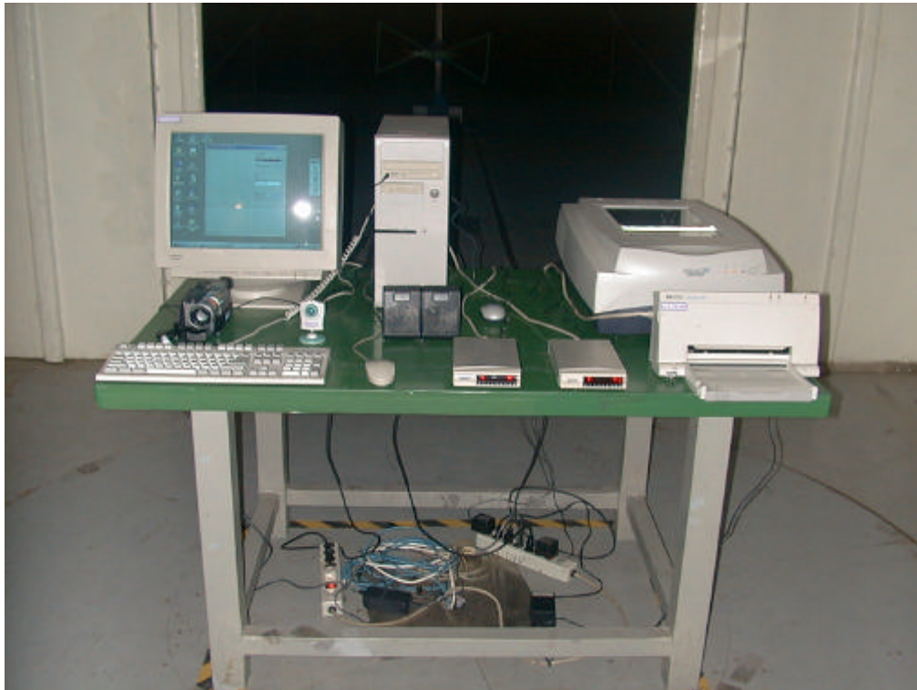
Back View of Radiated Test (Mode 2—Link PC, W/1394 Cable)