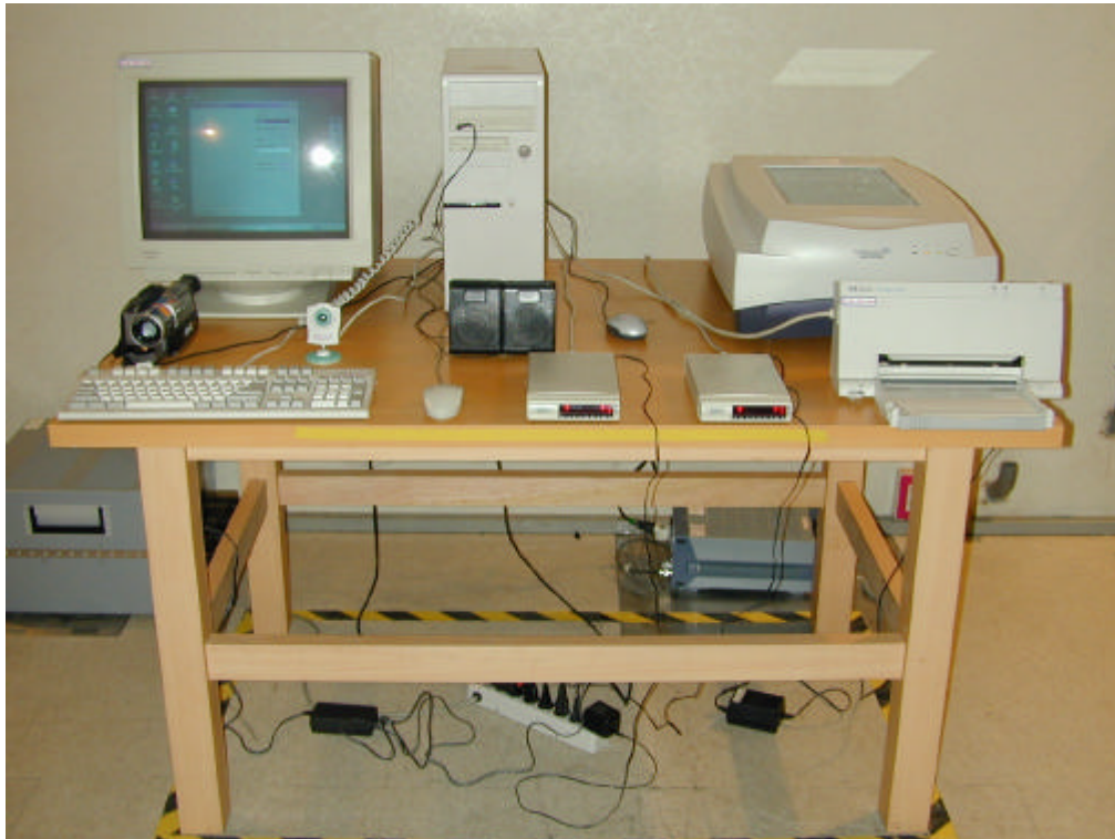
Back View of Conducted Test (Mode 2—Link PC, W/1394 Cable)