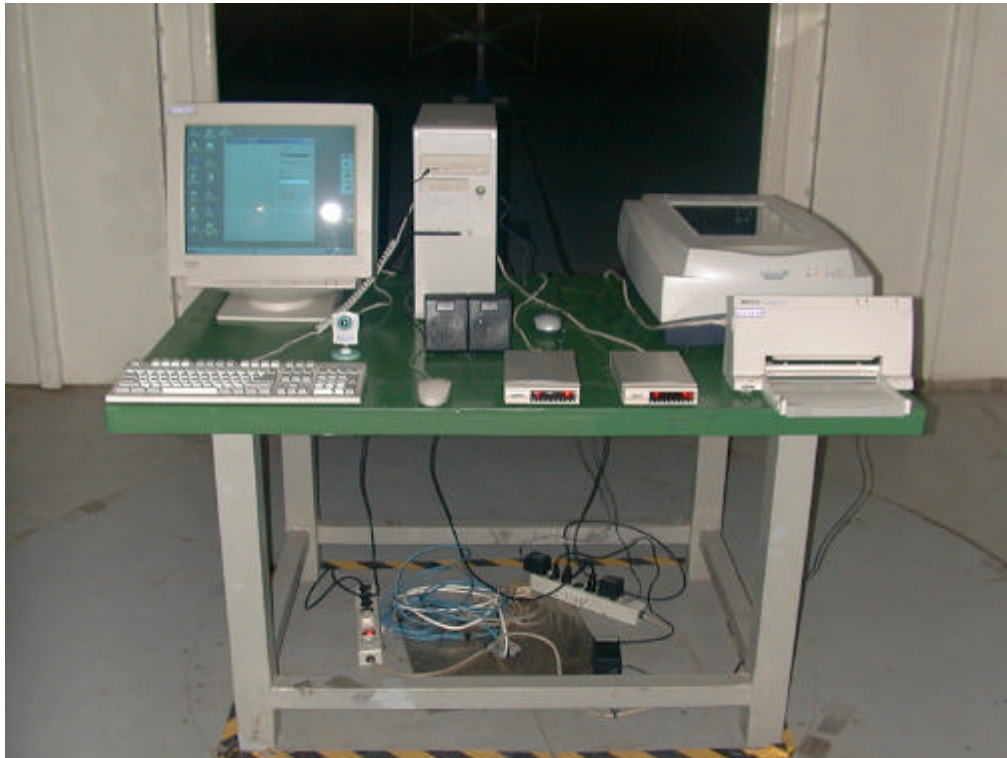
Back View of Radiated Test (Mode 1—Link PC, W/SCSI Cable)