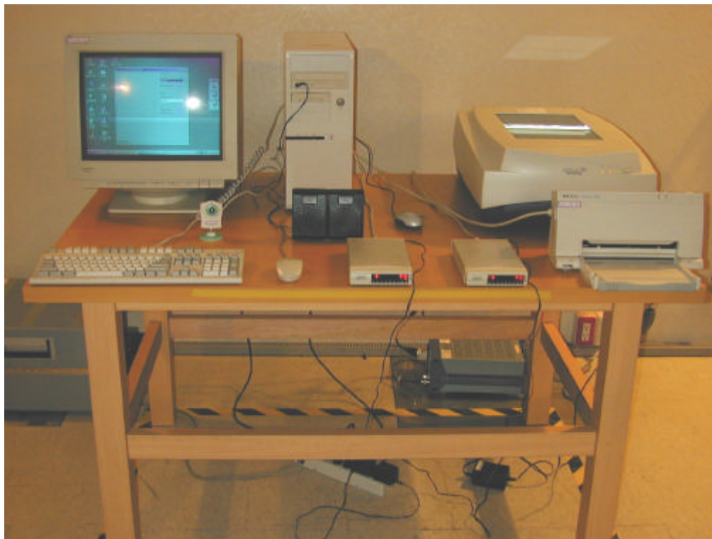
Back View of Conducted Test (Mode 1—Link PC, W/SCSI Cable)