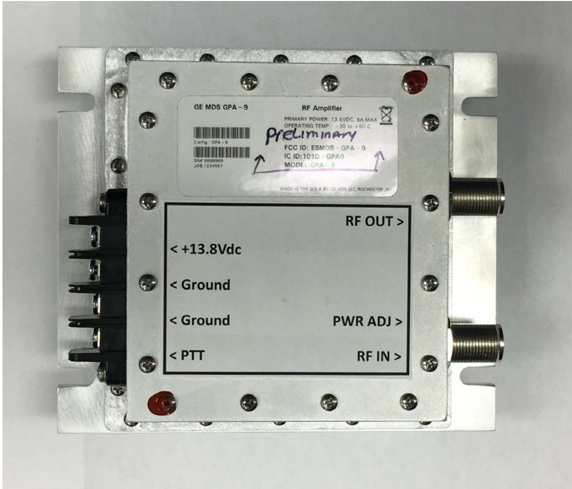
GPA-9B smaller heat-sink option