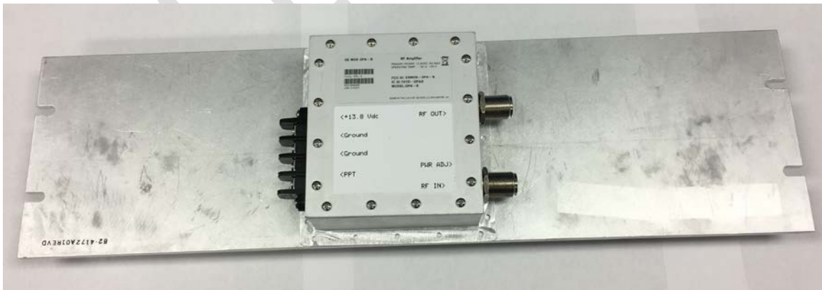
GPA-9 standard heat-sink option