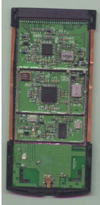
Figure 4: PCM Component Side