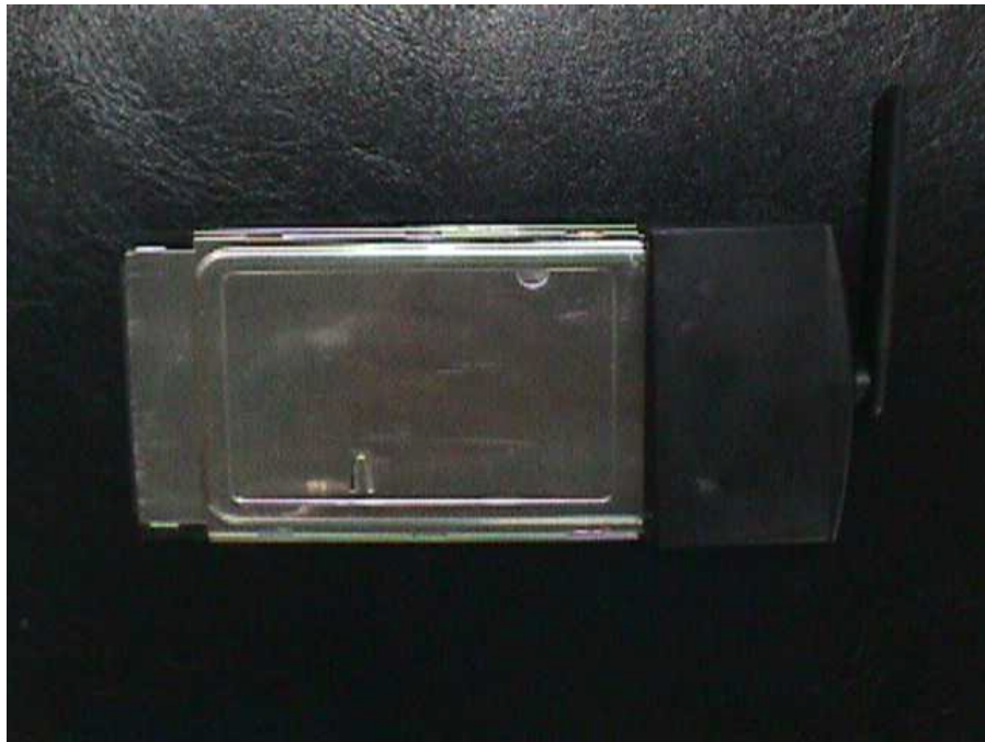
Figure 21: PCM Front