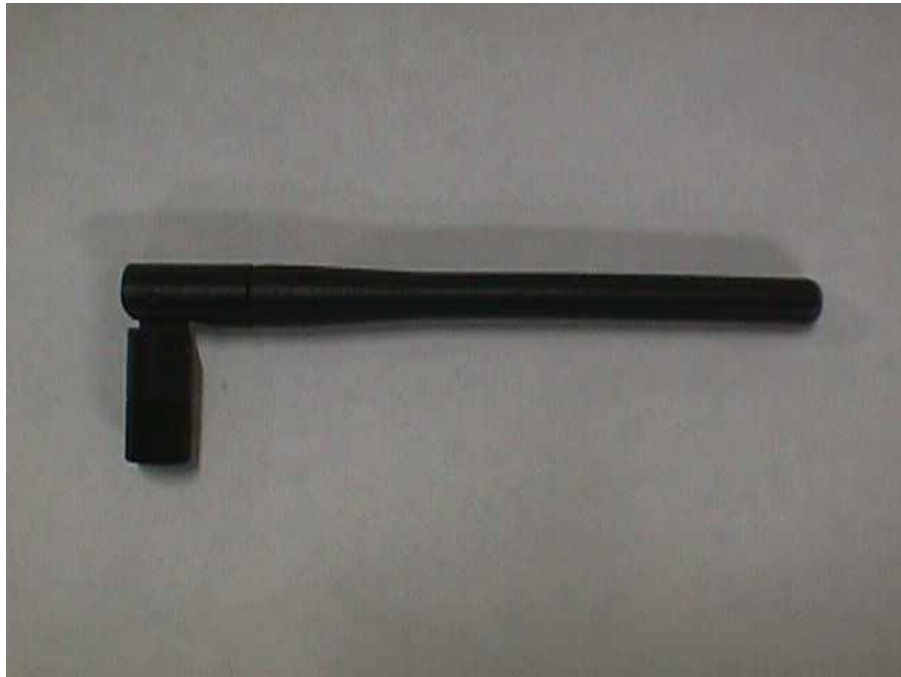
Figure 30: Stub Antenna