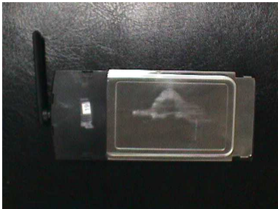
Figure 29: PCM Back Side