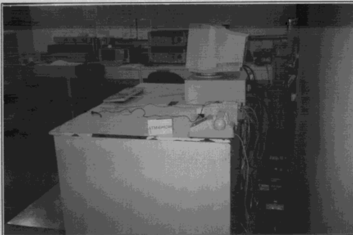
BACK VIEW OF CONDUCTED TEST