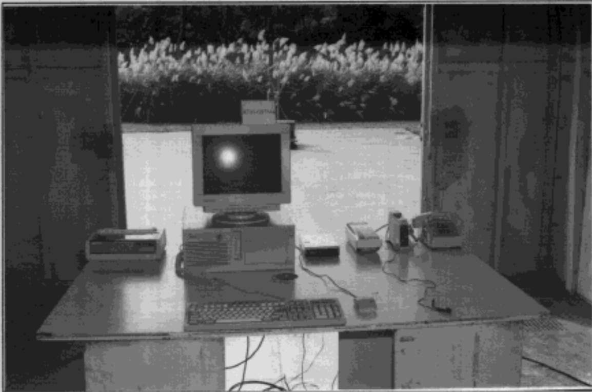
FRONT VIEW OF RADIATED TEST