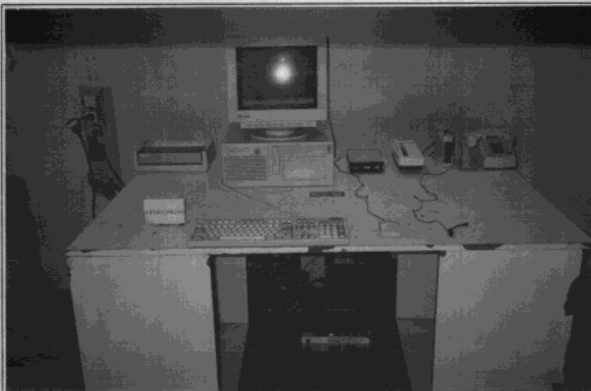
FRONT VIEW OF CONDUCTED TEST