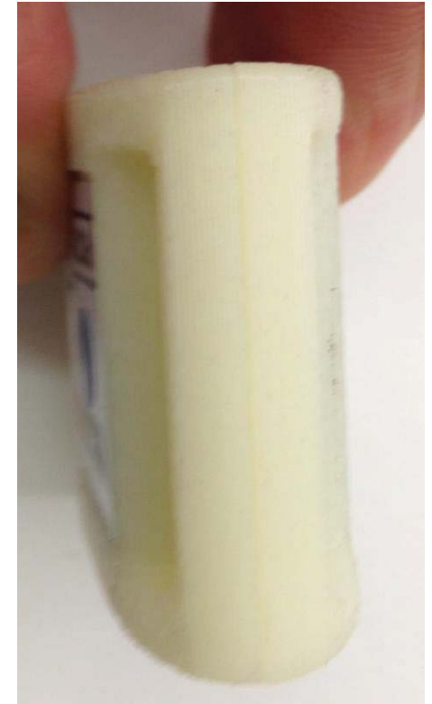
Strap External Views ( Identical both faces)