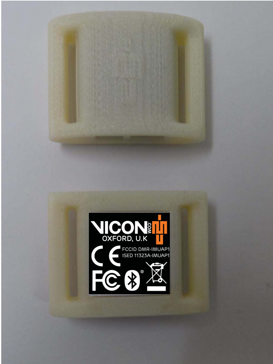
Top and Bottom External Views ( Simulated Label)